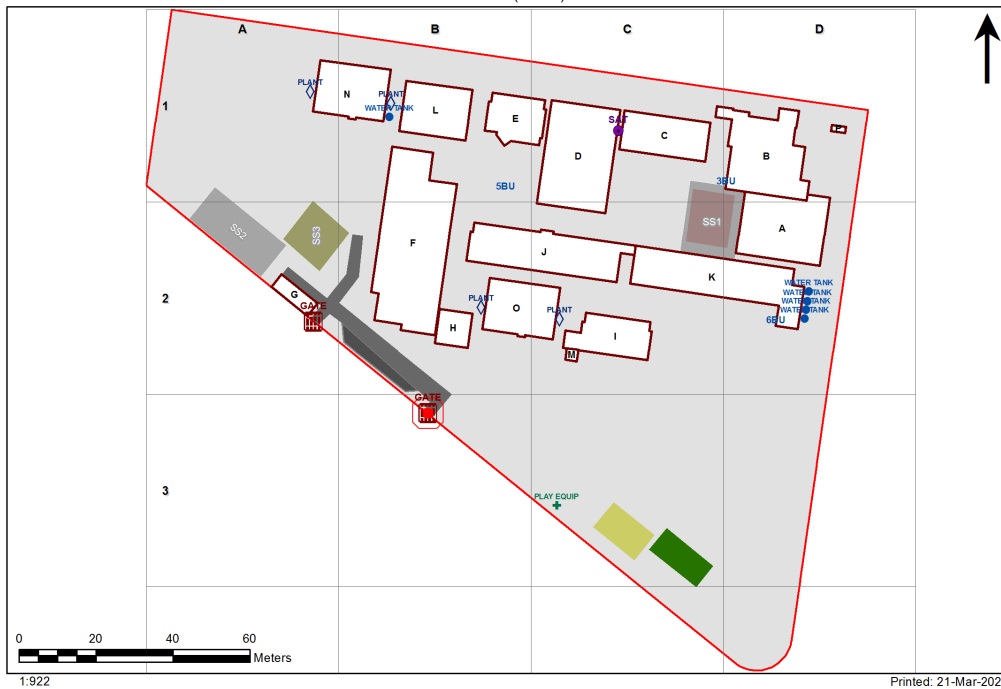
4027 - Griffith North Public School Site Plan (13069)