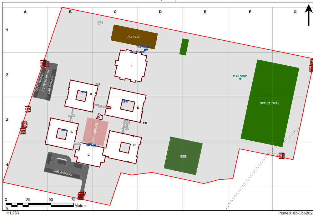
8436 - Granville South Creative and Performing Arts High Site Plan (10998)