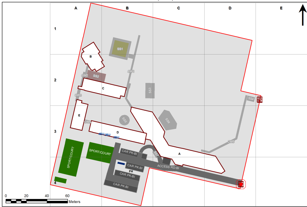
2041 - Goonellabah Public School Site Plan (12722)