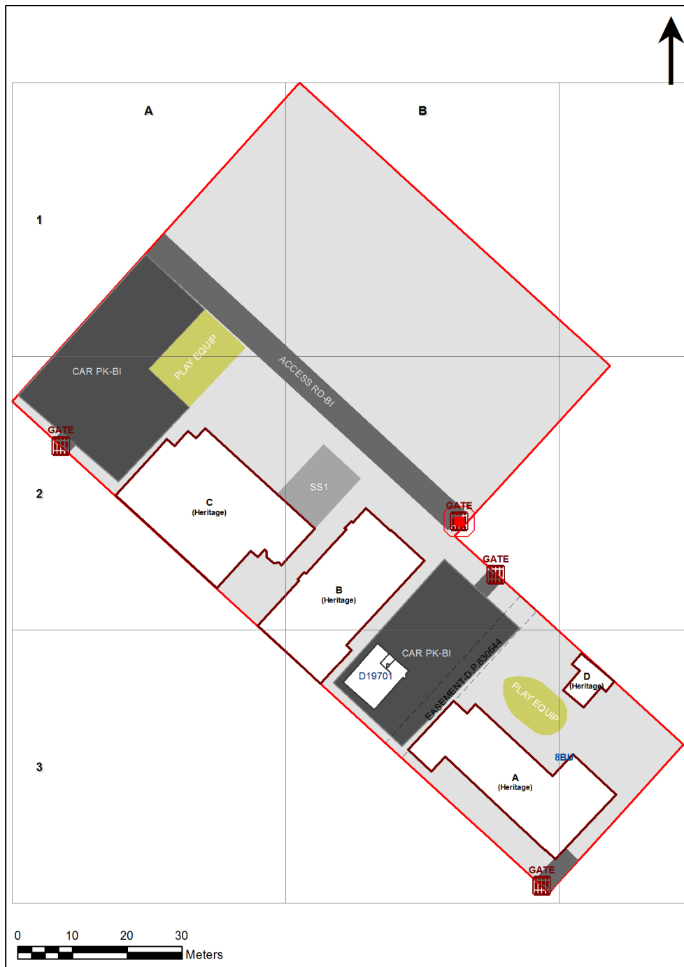
7419 - Glebe Public School Site Plan (12731)