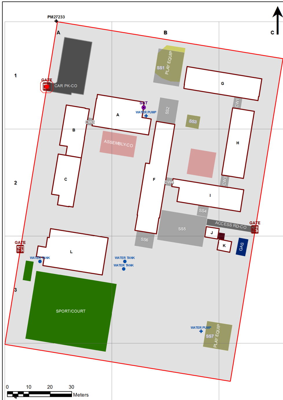
1979 - Gilgandra Public School Site Plan (12728)