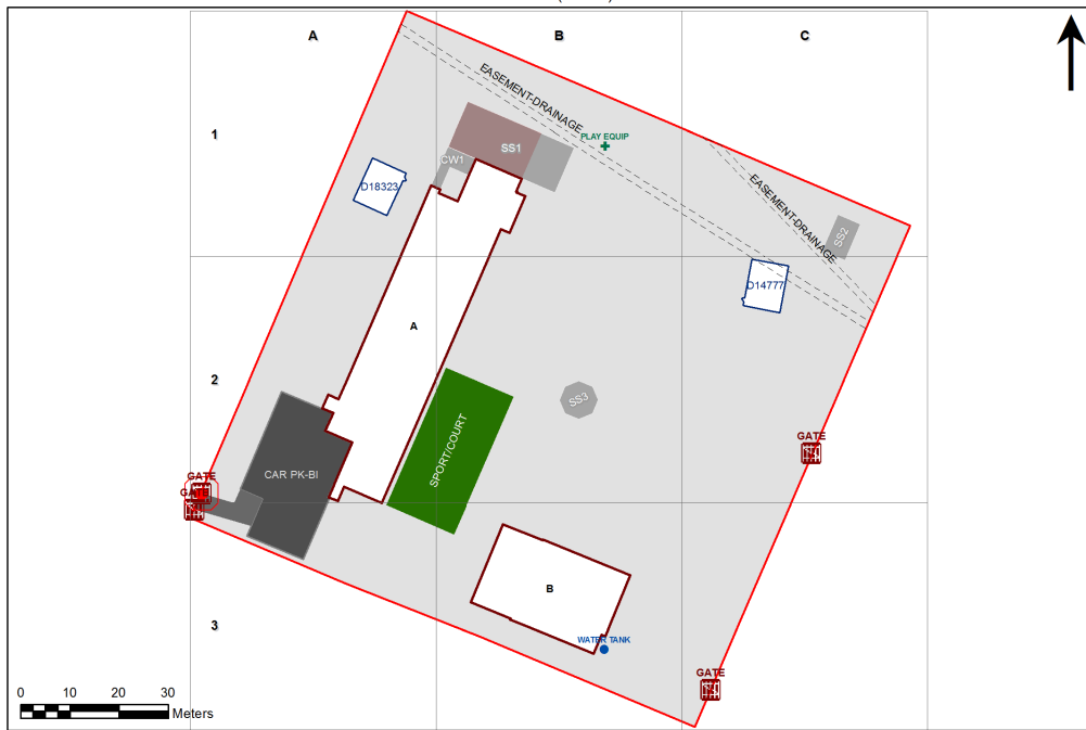
1844 - Enfield Public School Site Plan (10365)