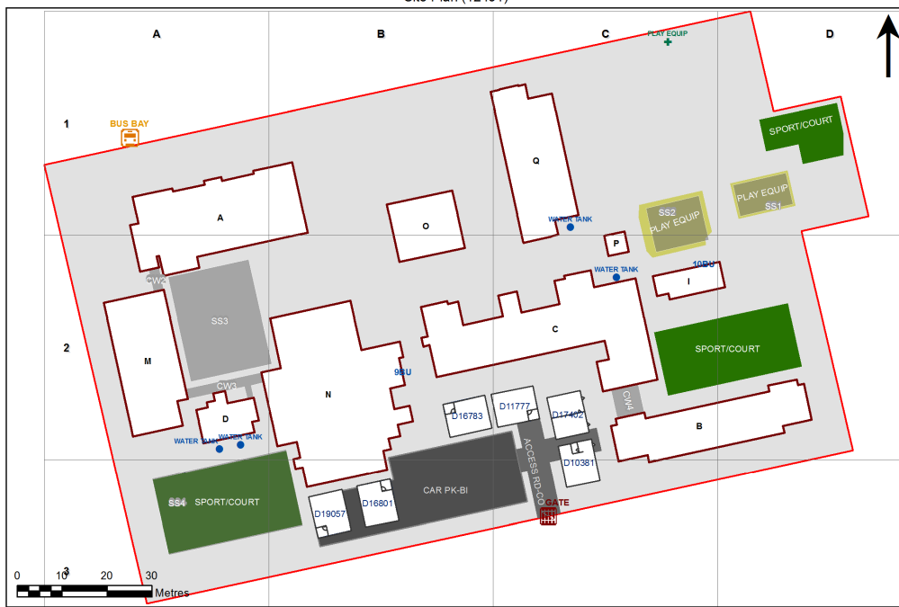
7416 - Eastwood Public School Site Plan (12491)