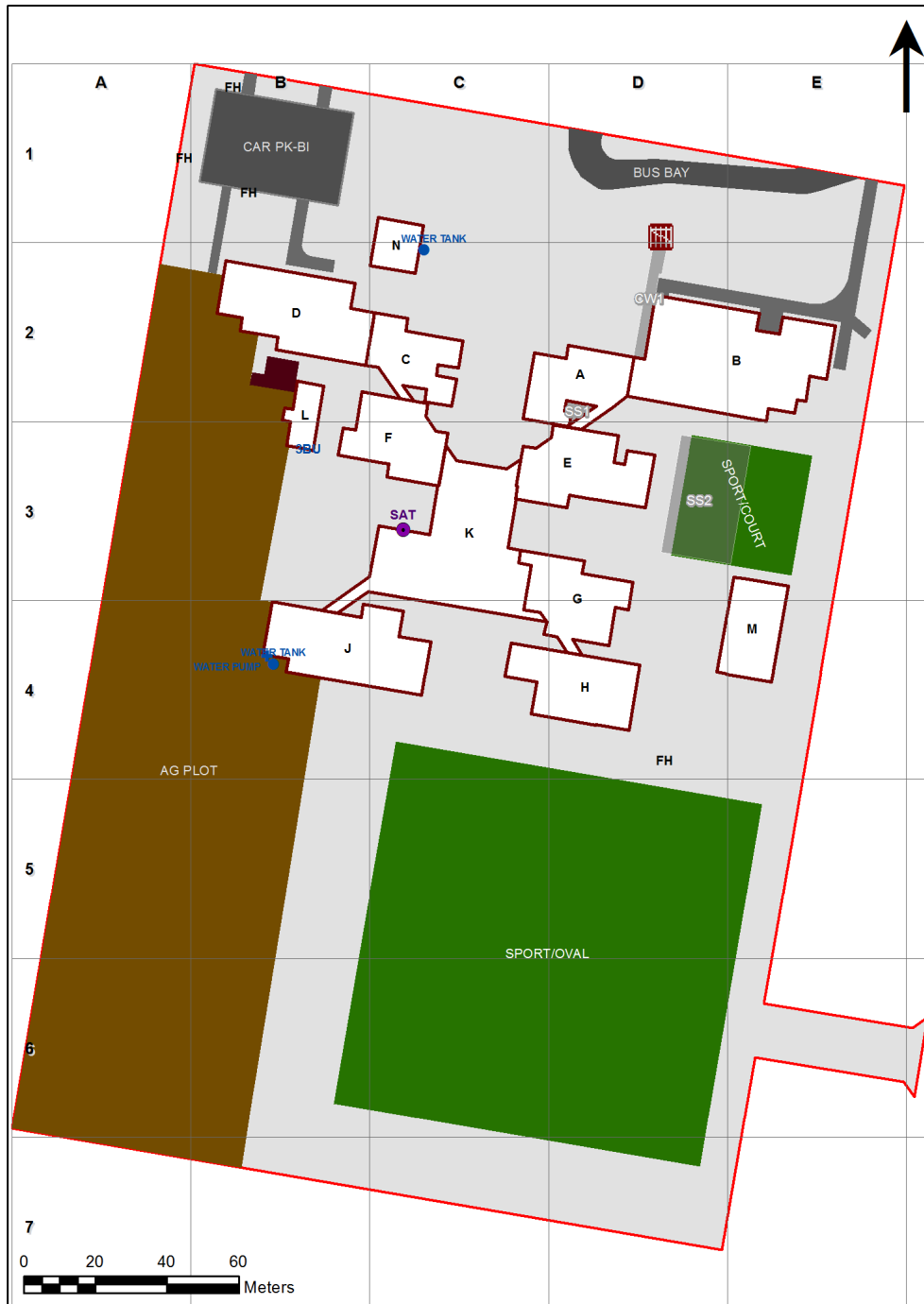
8543 - Dubbo College Delroy Campus Site Plan (10329)