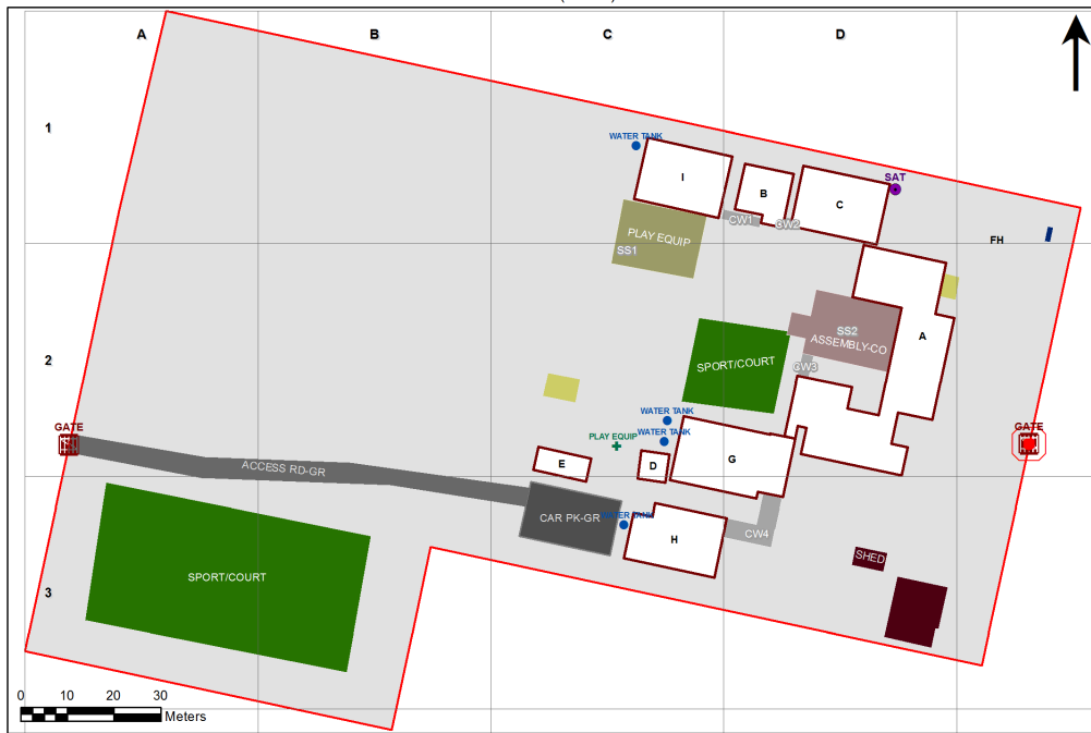
1749 - Denman Public School Site Plan (10330)