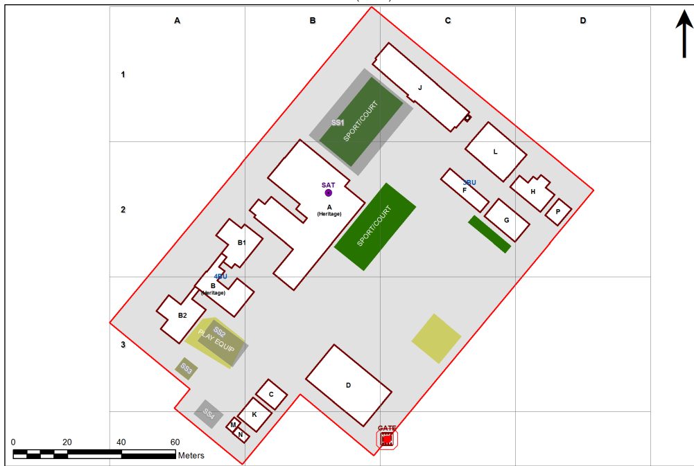
1636 - Cootamundra Public School Site Plan (12269)