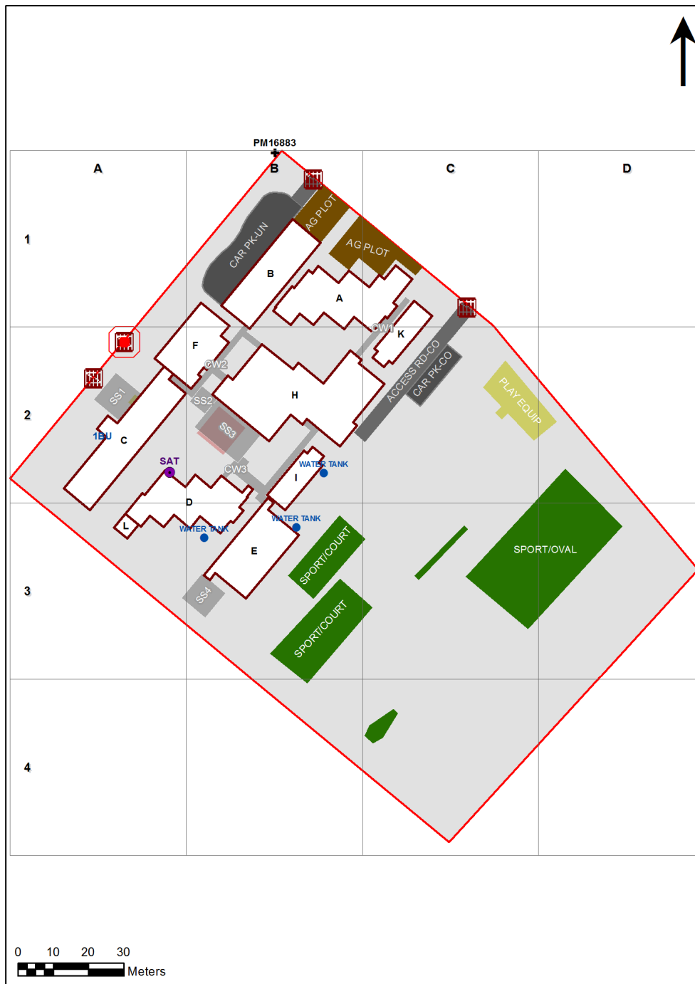
1612 - Coniston Public School Site Plan (12260)