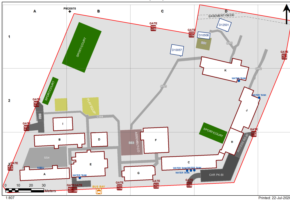
4183 - Budgewoi Public School Site Plan (11593)