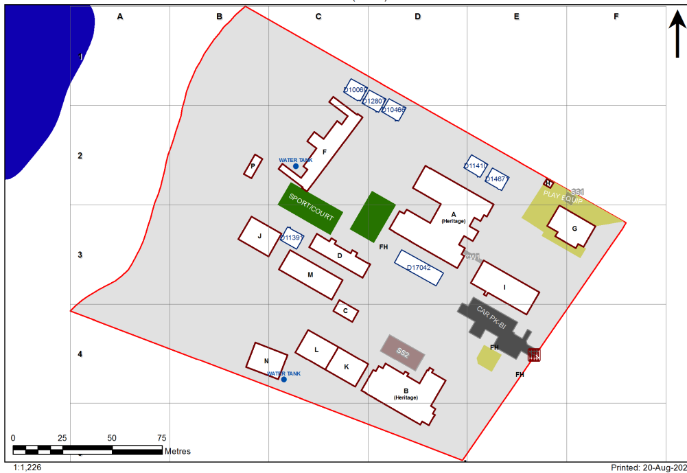
1358 - Brighton-Le-Sands Public School Site Plan (10107)