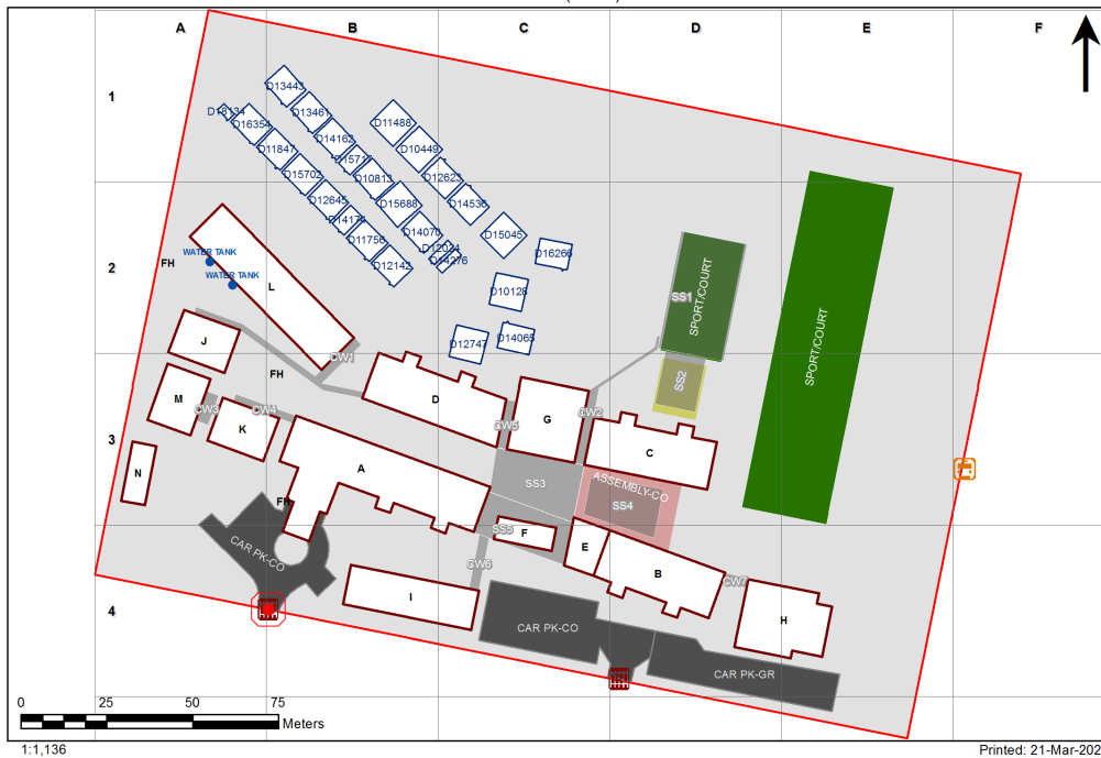
4594 - Bonnyrigg Heights Public School Site Plan (11554)