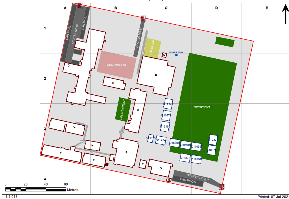
1257 - Blaxcell Street Public School Site Plan (10899)