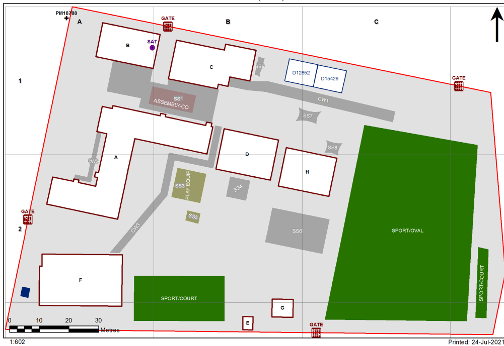
1177 - Bellbird Public School Site Plan (12323)