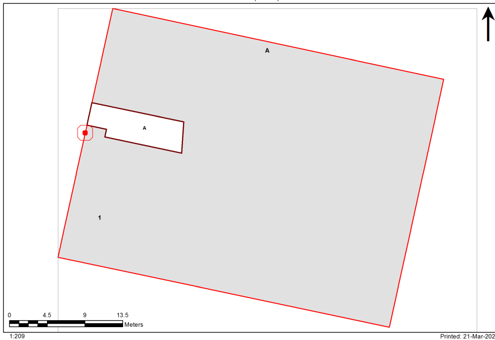
5548 - Bankstown Hospital School Site Plan (13019)