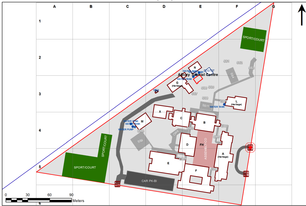
8101 - Albury High School Site Plan (12002)