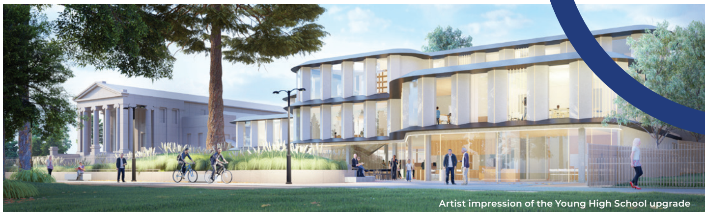
Artist impression of the Young High School upgrade