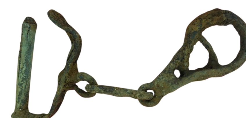
Carbine clip used by mounted troopers to attach their carbine (a short musket) when on horseback