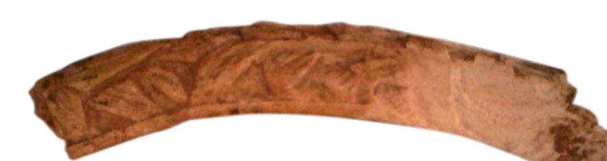
19th century piece of an animal rib bone (likely from a sheep), with hand-carved floral design, believed to have been part of a picture frame

The artefacts include fragments of glass and ceramics, buttons from police uniforms, pen nibs, a piece of an animal rib bone (likely from a sheep) with a hand-carved floral design, and firearms-related artefacts (including projectiles fired). Some of these are believed to be associated with the Lambing Flat riots.