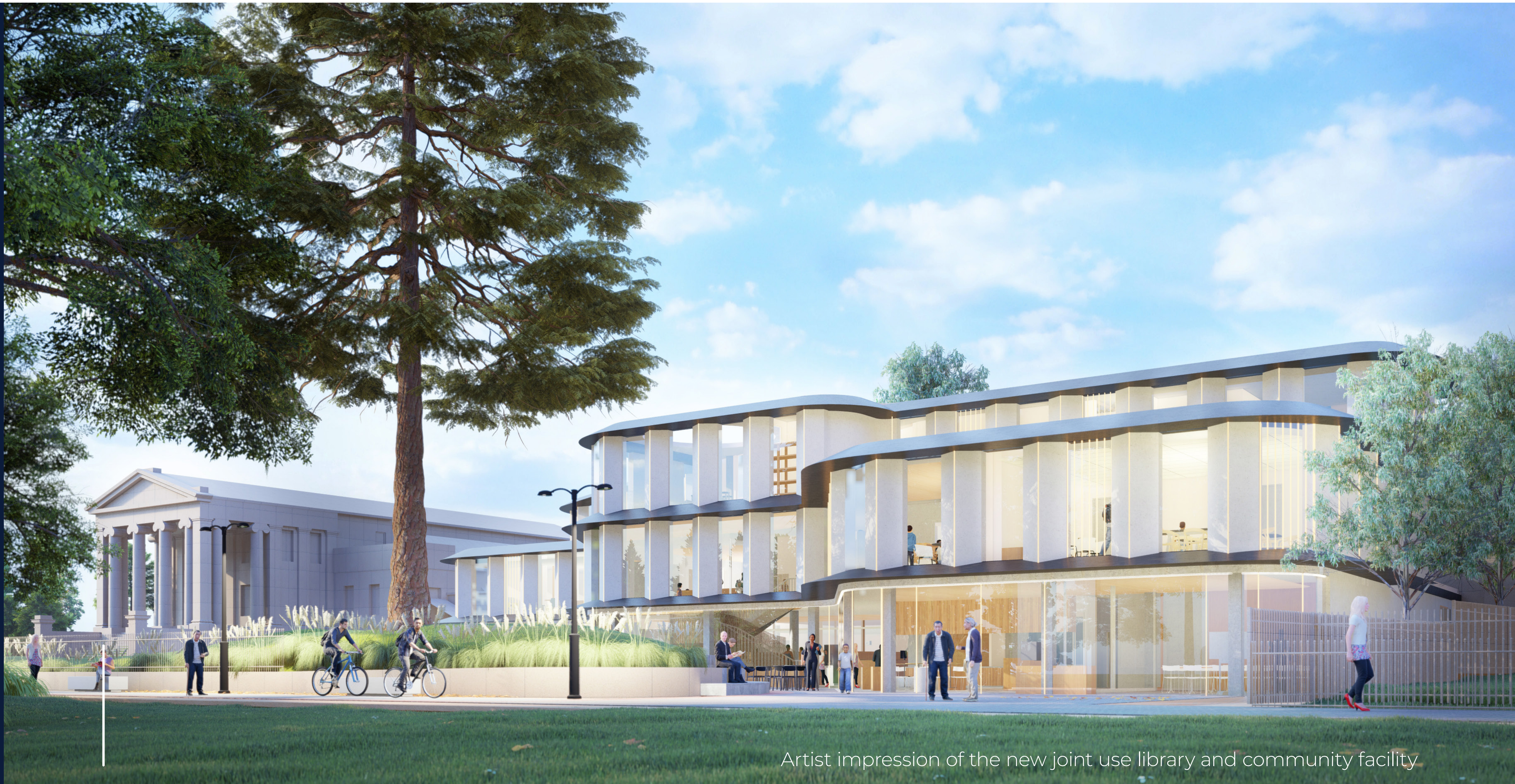
Artist impression of the new joint use library and community facility

The project will also include additional upgrades to other aspects of the school site, funded by the department. These will include: