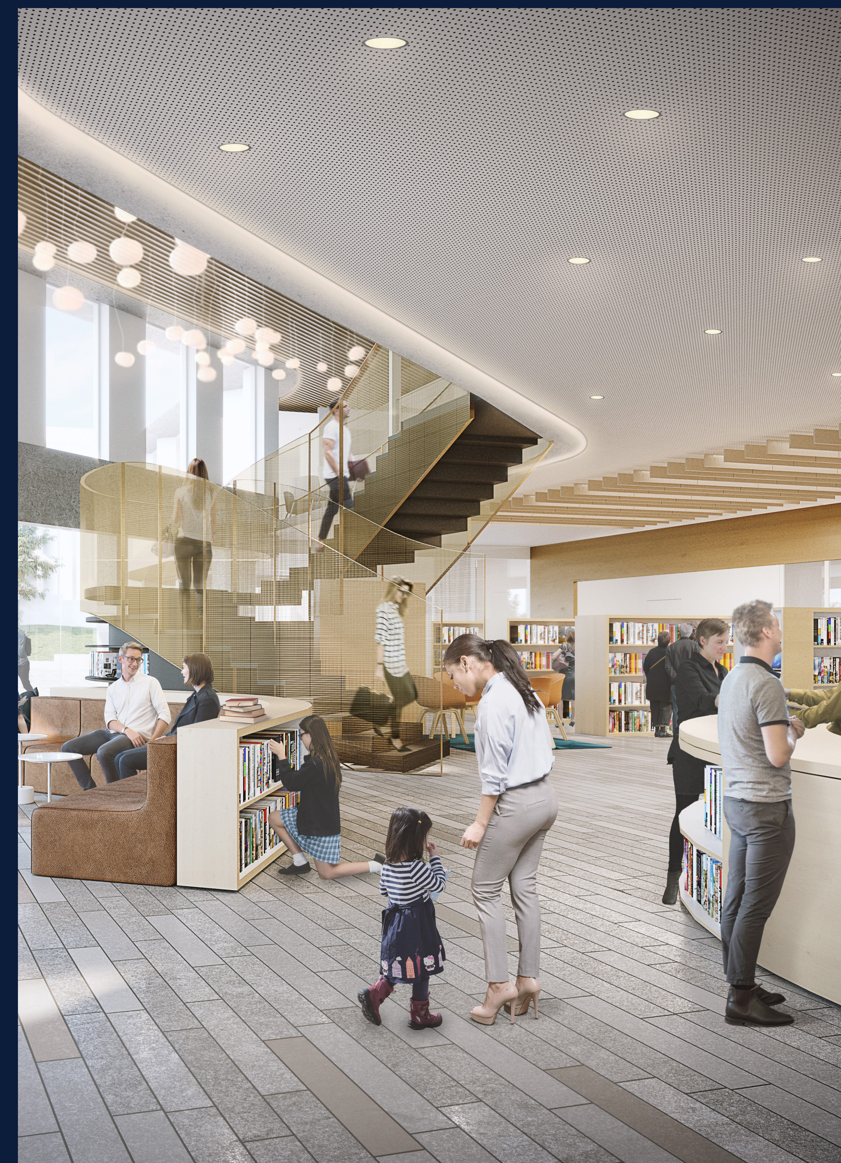
Artist impression inside the joint use library and community facility

Contact us between 9 am to 5 pm, Monday to Friday on 1300 482 651