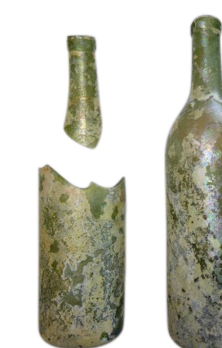
1860s bottles from a refuse pit at the government camp