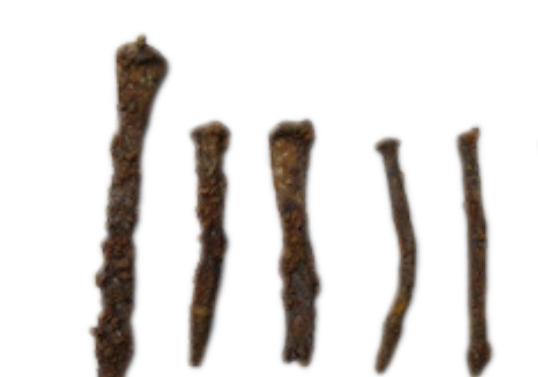
Examples of 19th century nails

Young High School upgrade and joint-use library and community facility