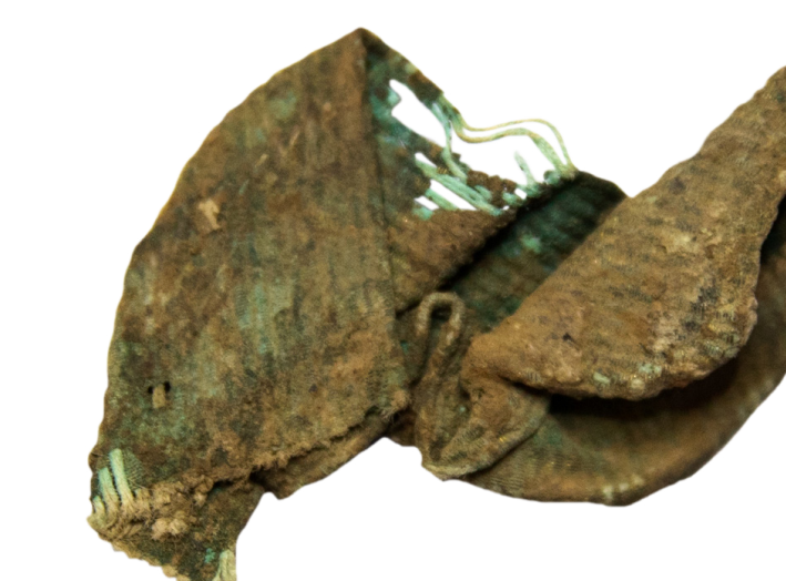
Piece of police "rank braid" from a uniform