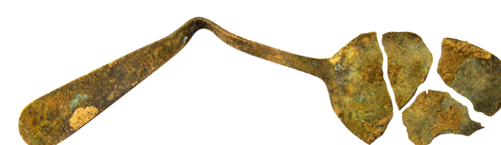
Remains of a spoon