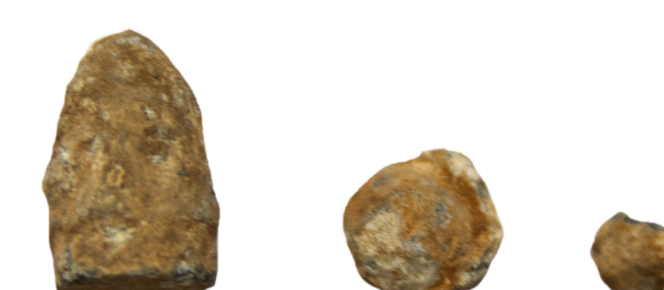
Examples of different types of projectiles found on the site