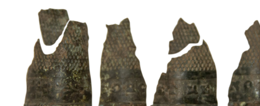
Fragments of 19th century thimbles with "forget me not" embossed around the base