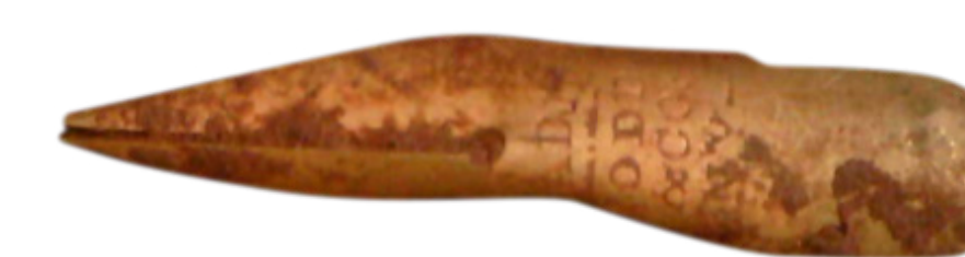
Gold pen nib