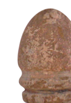
1860s revolver projectile