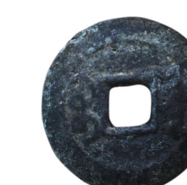
Chinese coin dated to 1723-1908, evidence of the presence of Chinese people on the Gold Fields