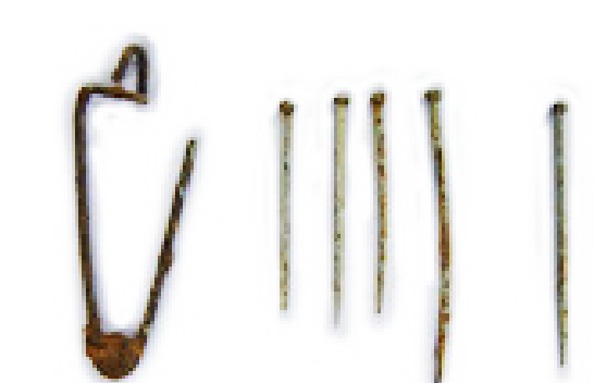
Examples of a 19th century safety pin and various straight pins