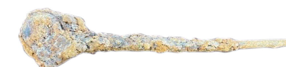
Corroded metal spike