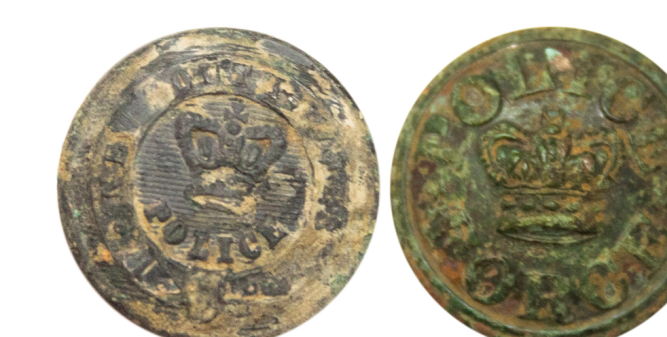
19th century NSW police buttons