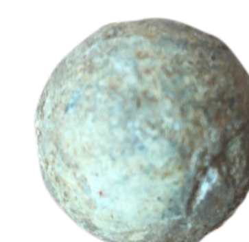
Carbine ball from an early 1860s police carbine (short musket) of the type used during the riot of 1861