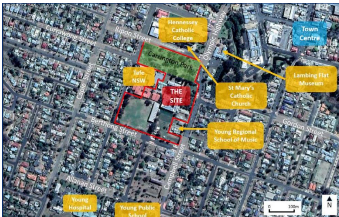
Figure 1 | Local Context Map

The site is made up of Young High School and Carrington Park and has an area of approximately 4.7 hectares. It is located on Campbell Street, Young within the Hilltops Local Government Area (LGA). Immediately adjacent to the site and to the west is a TAFE NSW campus. To the north of the site on the other side of Carrington Park and Ripon Street are a number of heritage buildings of local significance, including Hennessey Catholic College and St Marys Catholic Church. The Lambing Flat Museum is located across Campbell Street to the north-east of the site. Immediately to the east and south of the site are predominantly single storey dwellings. The site and its context are shown in Figure 1.