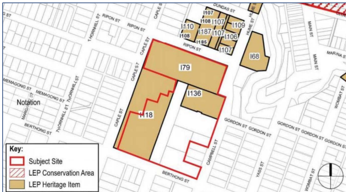
Figure 2 | YLEP Heritage Map