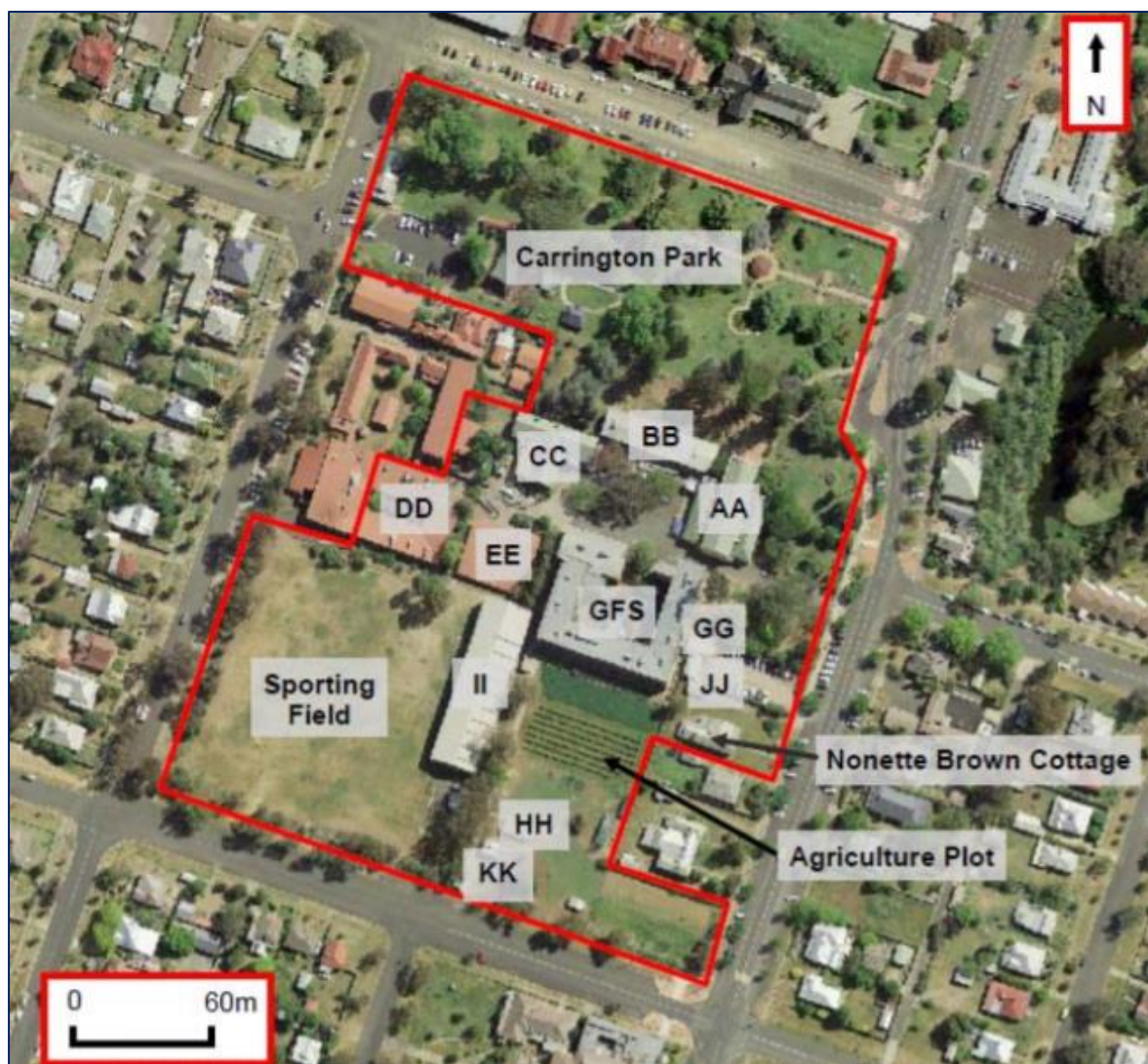
Figure 3 | Existing Site Building Context Map

At the time of the original determination, the site was the subject of a nomination for listing on the State Heritage Register. At that time, Heritage NSW advised it had “resolved that the Carrington Park Precinct is potentially of state heritage significance due to its association with the Lambing Flat Anti-Chinese Riots.” The nomination remains under consideration.