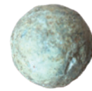
Carbine ball from an early 1860s police carbine (short musket) of the type used during the riot of 1861