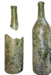
1860s bottles from a refuse pit at the government camp