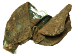
Piece of police "rank braid" from a uniform