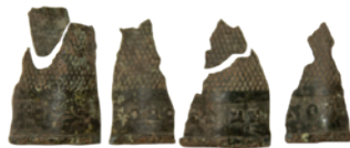
Fragments of 19th century thimbles with "forget me not" embossed around the base