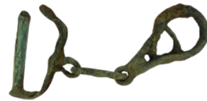
Carbine clip used by mounted troopers to attach their carbine (a short musket) when on horseback