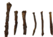
Examples of 19th century nails