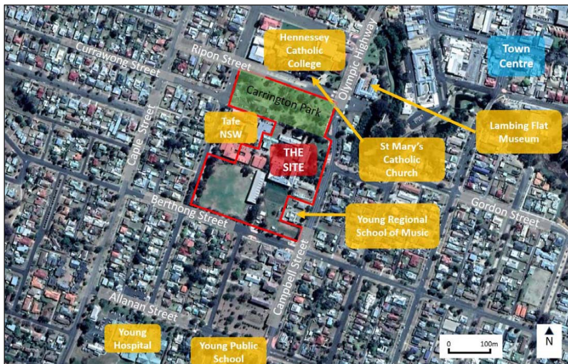
Figure 1 | Local Context Map

Immediately adjacent to the site to the west is a TAFE NSW campus. To the north of the site on the other side of Carrington Park and Ripon Street are a number of heritage buildings of local significance, including Hennessey Catholic College and St Marys Catholic Church. The Lambing Flat Museum is located across Campbell Street to the north-east of the site. Immediately to the east and south of the site are predominantly single storey dwellings. The site and its context are shown in Figure 1 .