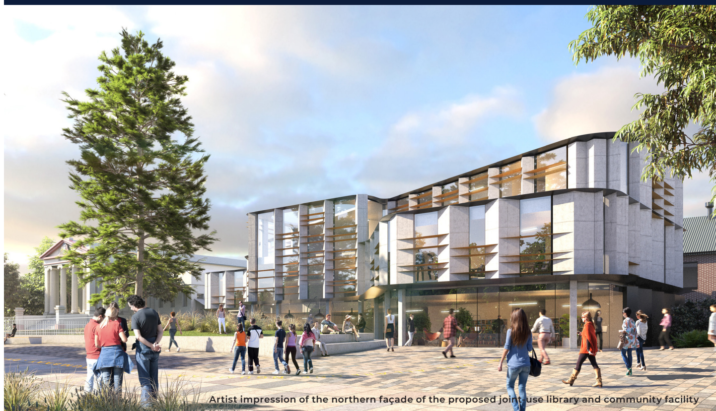
Artist impression of the northern façade of the proposed joint-use library and community facility

The planned joint-use library and community facility will be a ground-breaking community landmark.