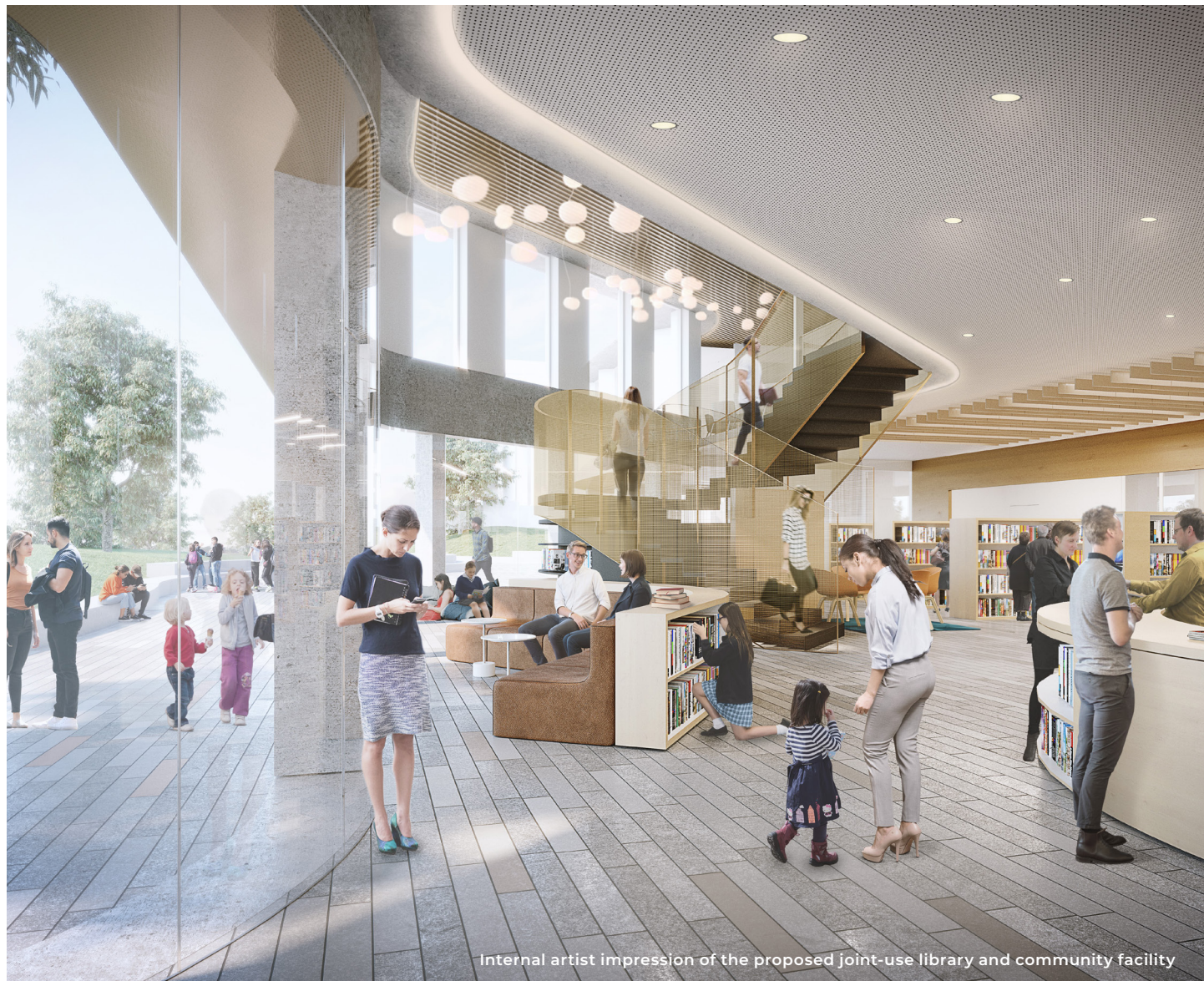
Internal artist impression of the proposed joint-use library and community facility