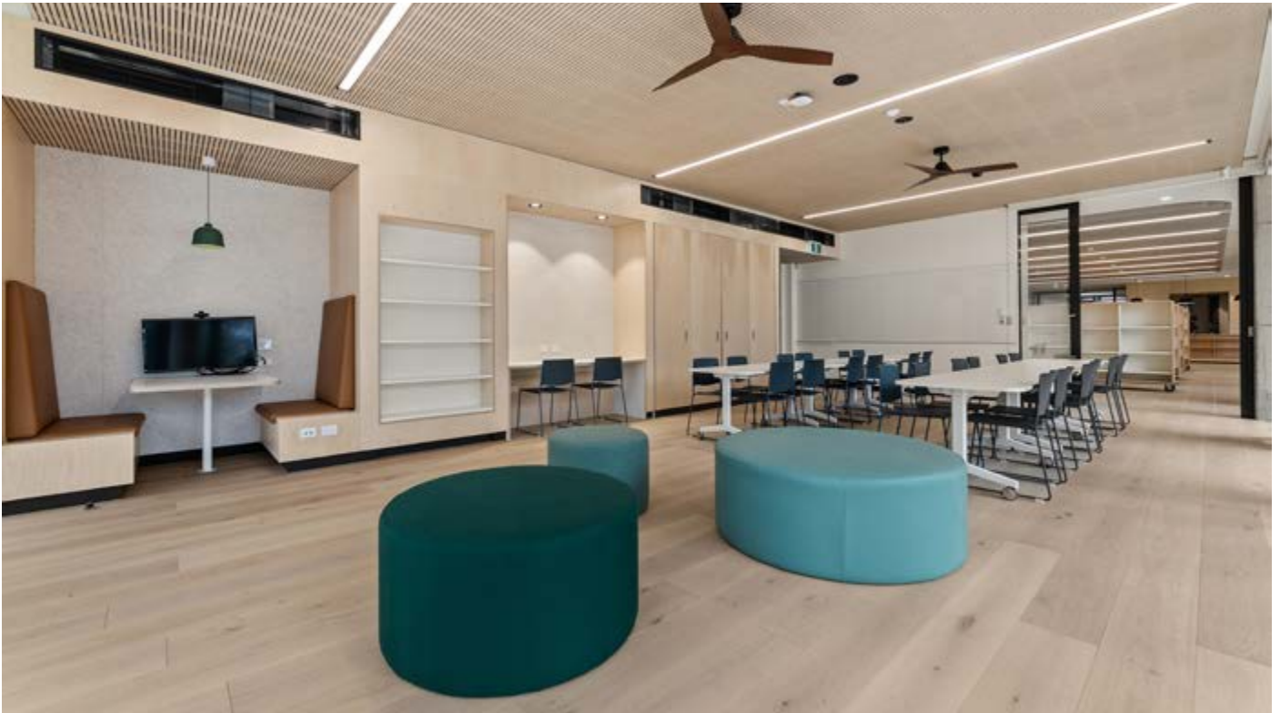
Wiradjuri learning centre