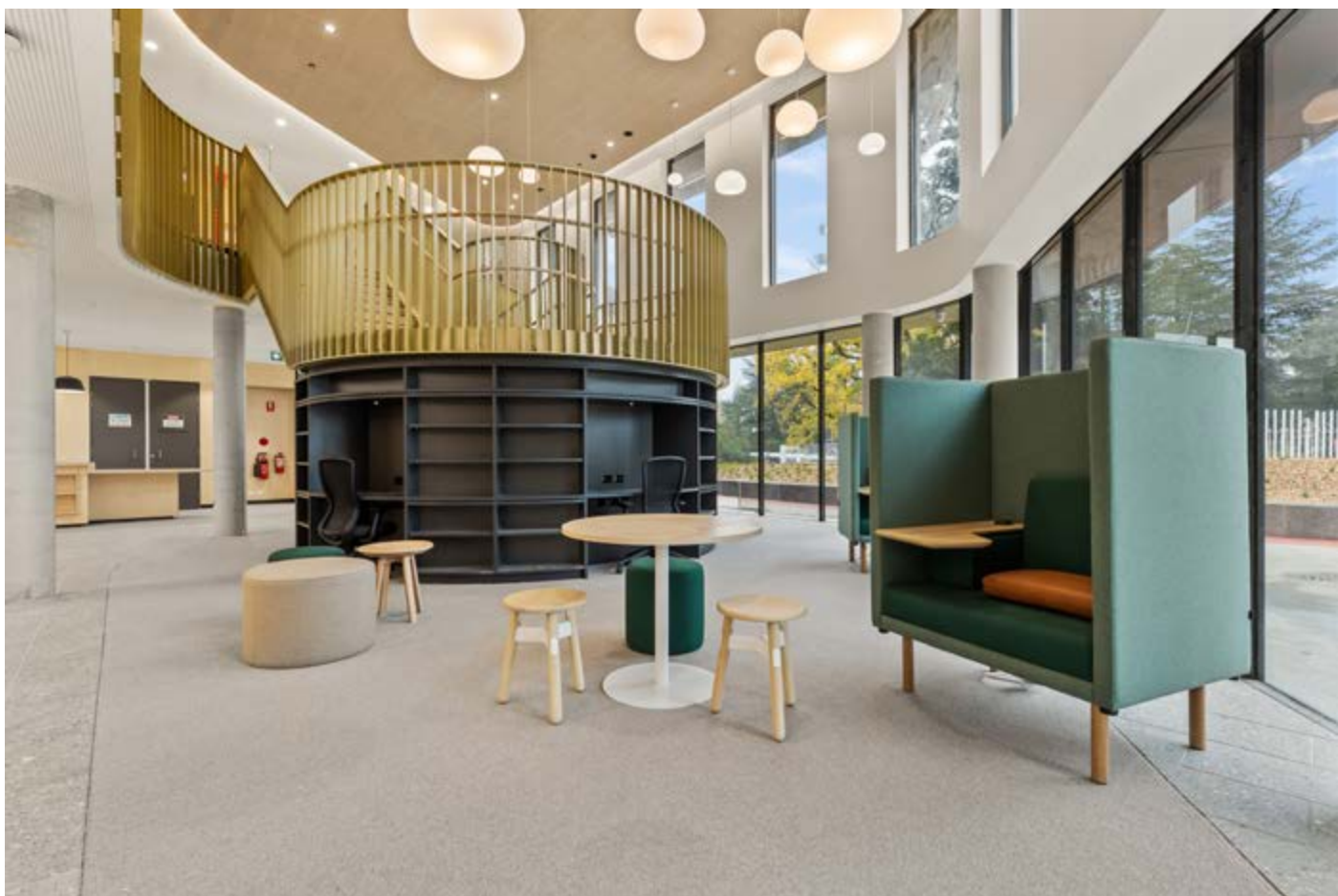
Community reading and study area