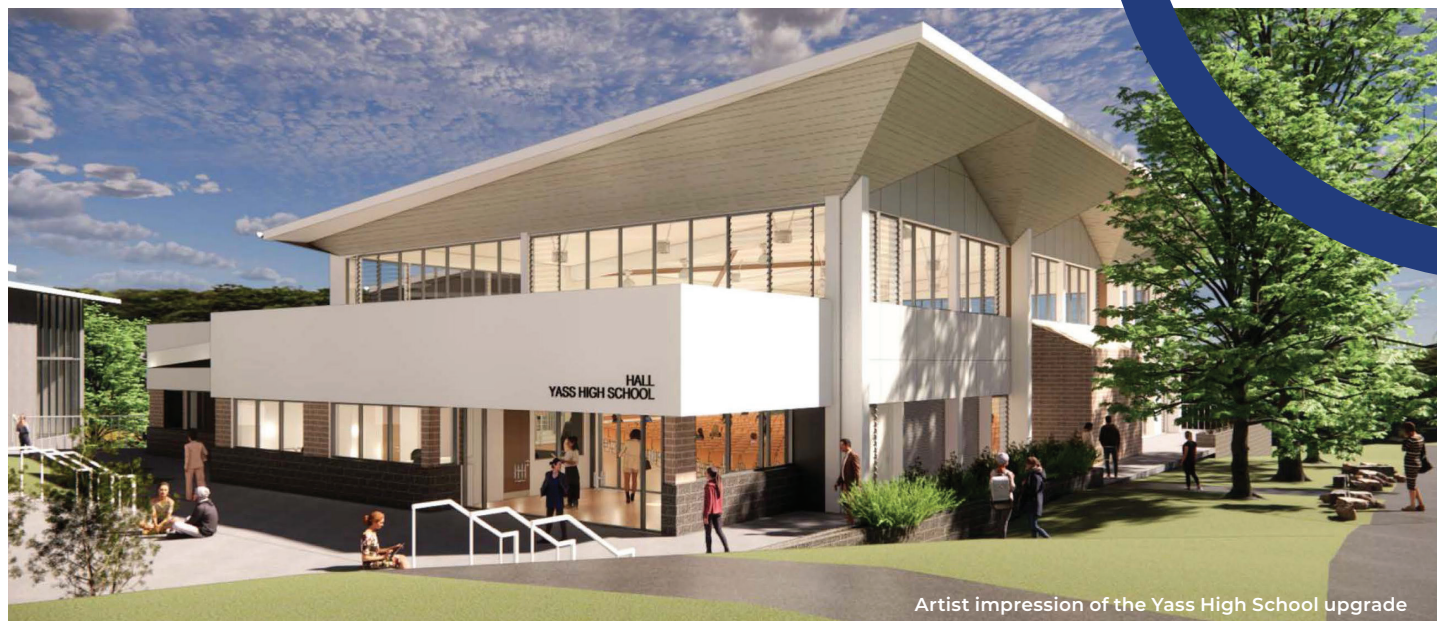
Artist impression of the Yass High School upgrade