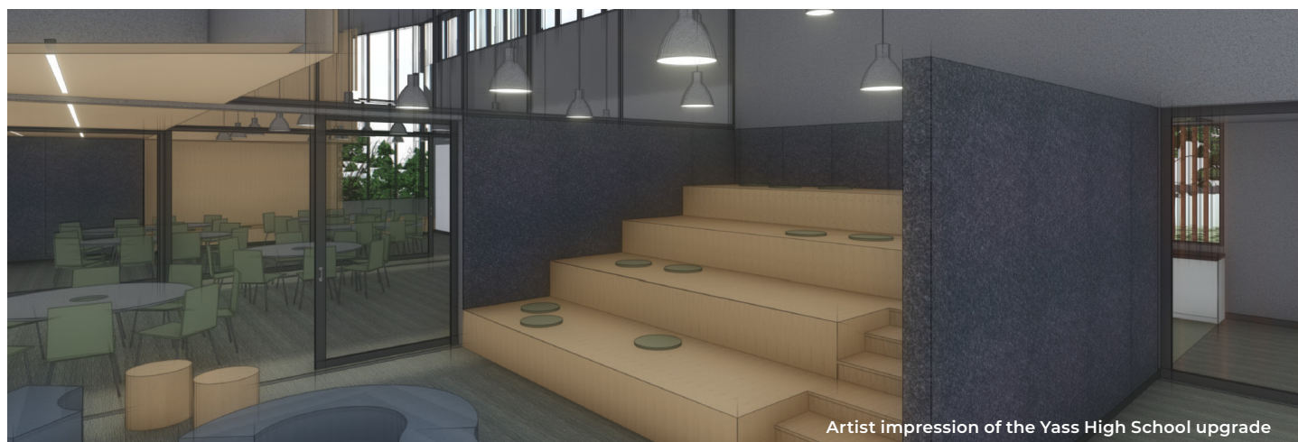
Artist impression of the Yass High School upgrade