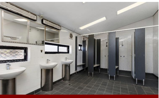
Hindmarsh Building upgraded male bathroom