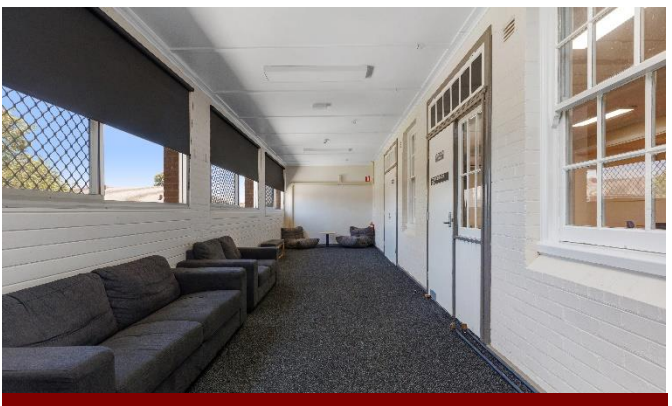
Mutch Building revitalised living common area