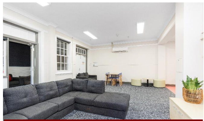
Mutch Building upgraded common living area