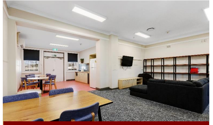
Mutch Building upgraded common living area