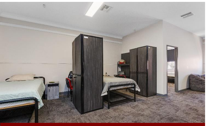
Mutch Building refurbished shared room