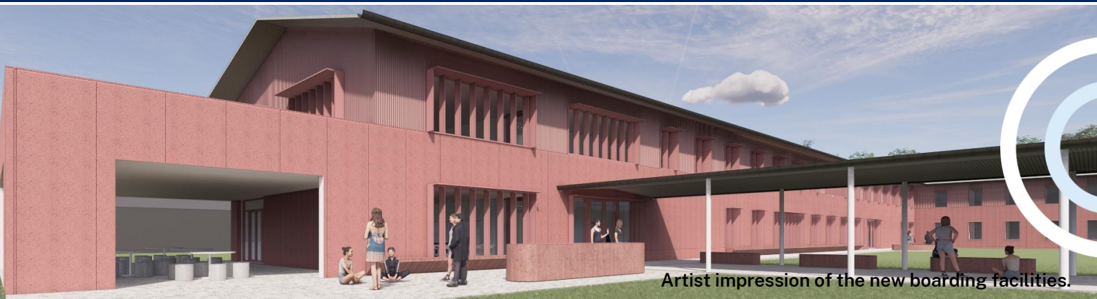
Artist impression of the new boarding facilities.