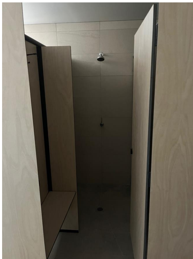
New female boarding facility interior bathroom fit out