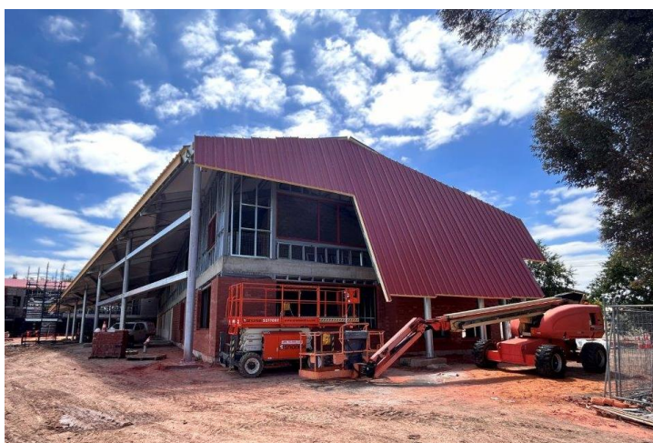
New female boarding facility structural steel and roof installation