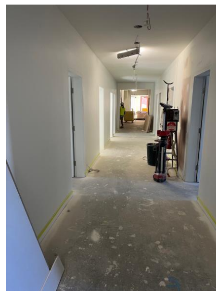
New female boarding facility interior wall construction, electrical works and fit out