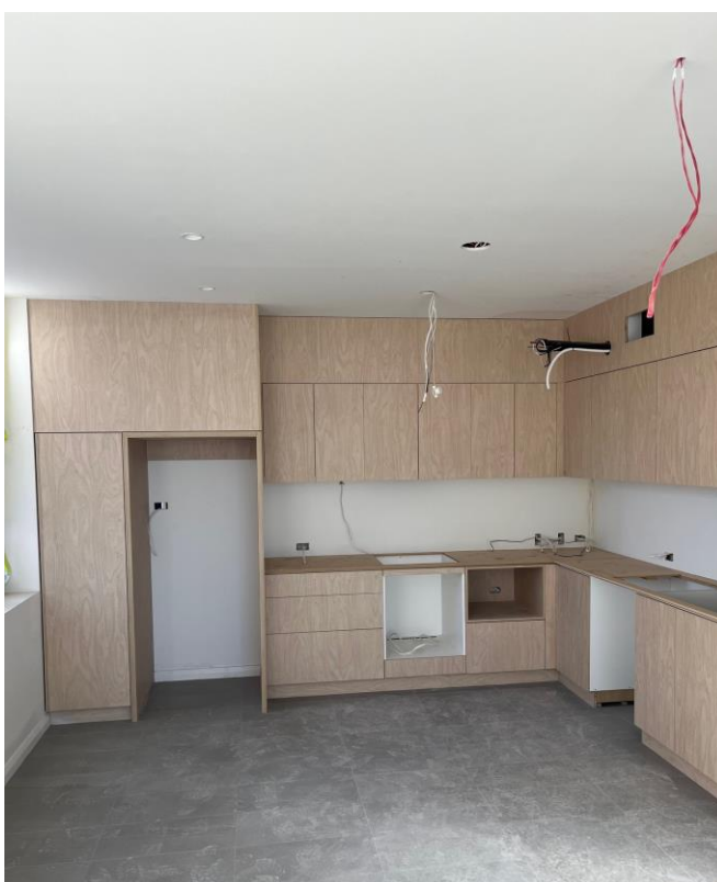
New female boarding facility construction and kitchen fit out