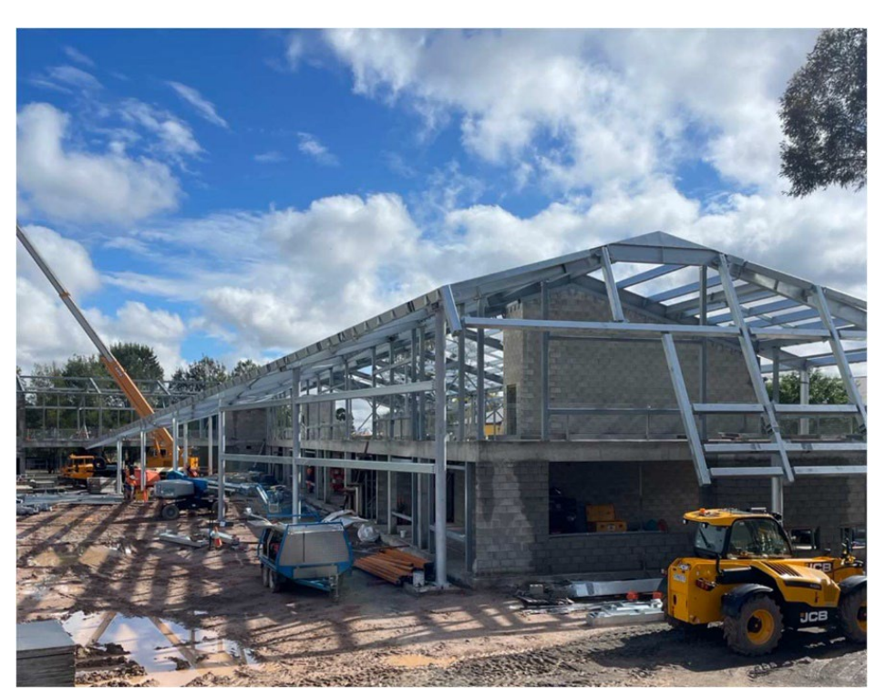
New female boarding facility

Construction of the new boarding facilities is well underway. This includes the completion of the level one structural steel installation and masonry on the ground floor.