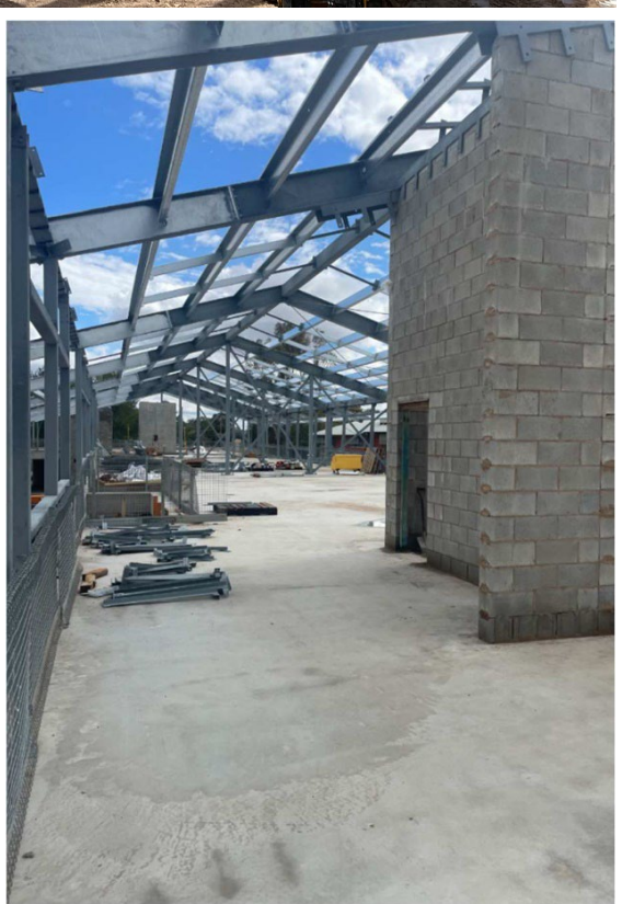
New female boarding facility

School Infrastructure NSW Email: <u>schoolinfrastructure@det.nsw.edu.au</u> Phone: 1300 482 651