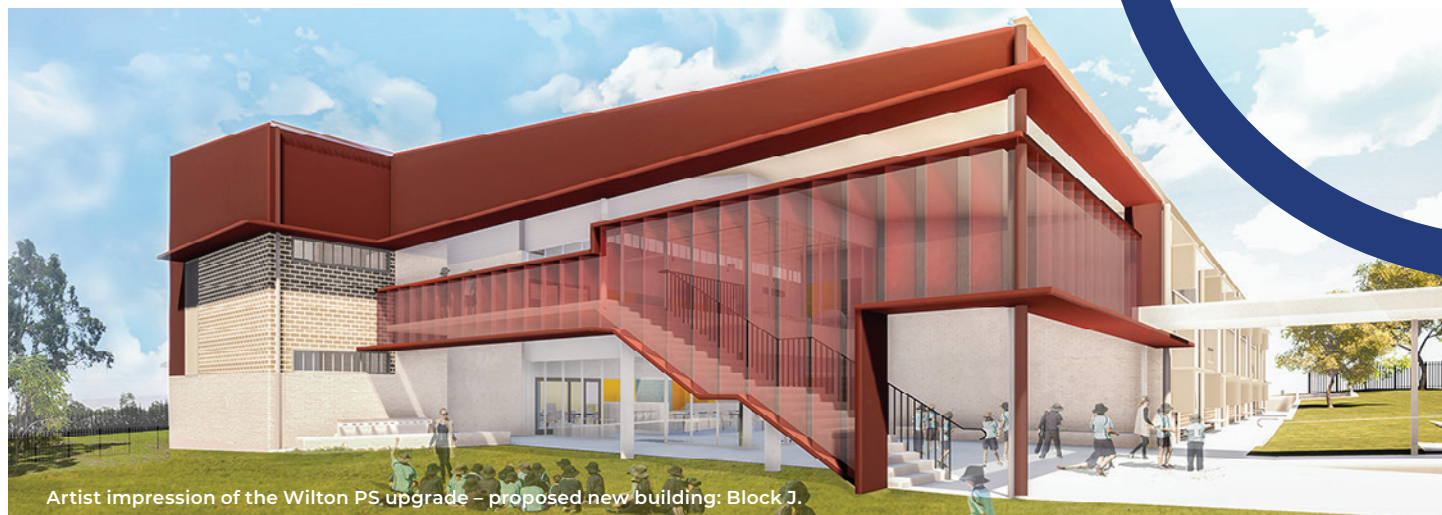
Artist impression of the Wilton PS upgrade – proposed new building: Block J.