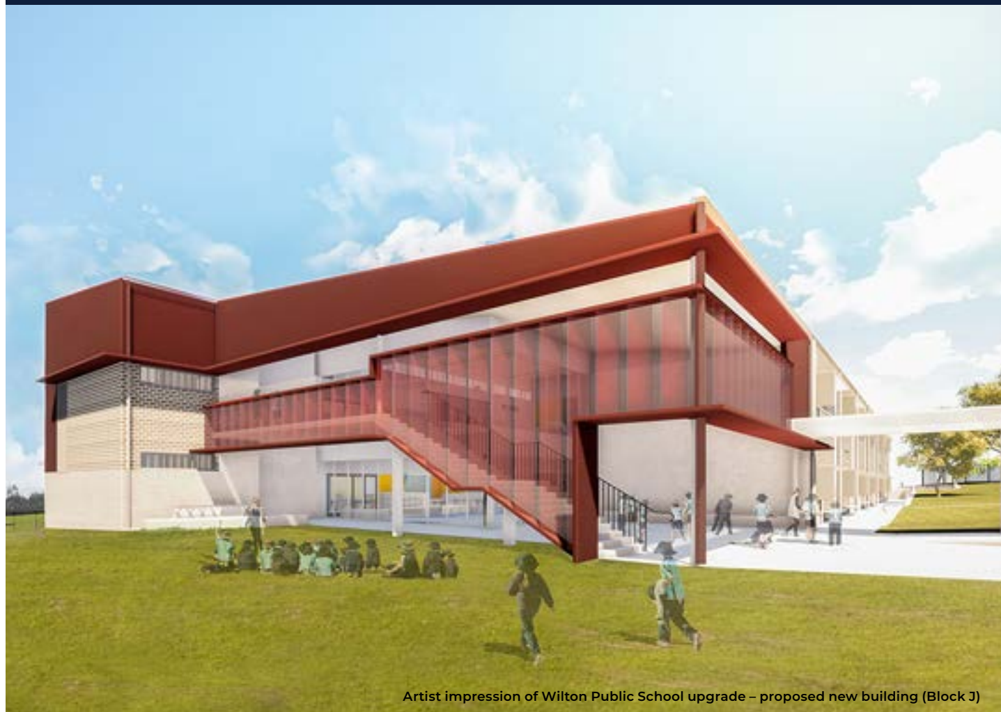
Artist impression of Wilton Public School upgrade – proposed new building (Block J)

The NSW Government is investing $6.7 billion over four years to deliver more than 190 new and upgraded schools to support communities across NSW. In addition, a record $1.3 billion is being spent on school maintenance over five years. This is the largest investment in public education infrastructure in the history of NSW.