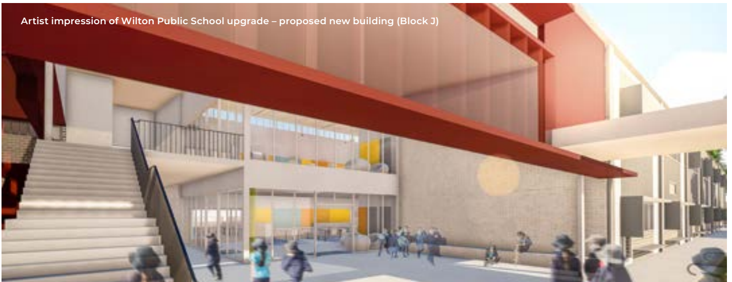
Artist impression of Wilton Public School upgrade – proposed new building (Block J)