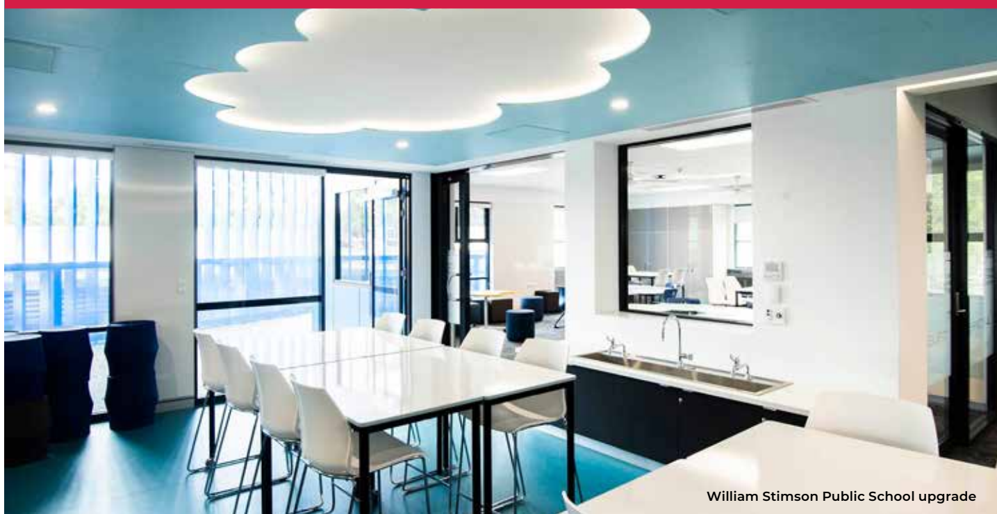
William Stimson Public School upgrade