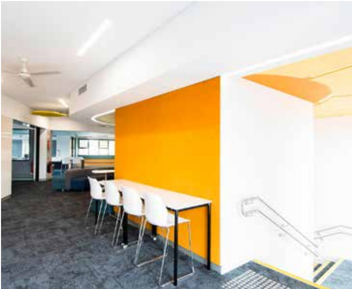
Innovative learning spaces