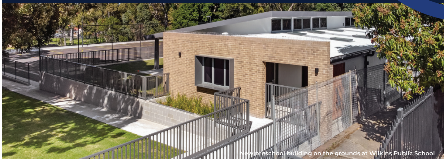
New preschool building on the grounds at Wilkins Public School