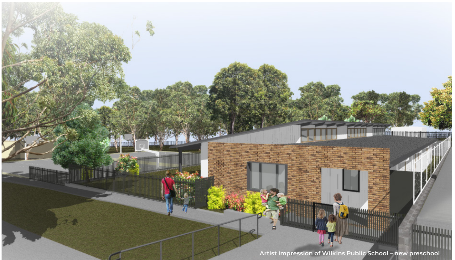
Artist impression of Wilkins Public School – new preschool

At the end of the extended licence period, operation of the new preschool and before and after school facilities will be opened to a competitive tender and regulatory approval process. Should the Council elect to do so, it will have the option to participate in the service provider tender process.