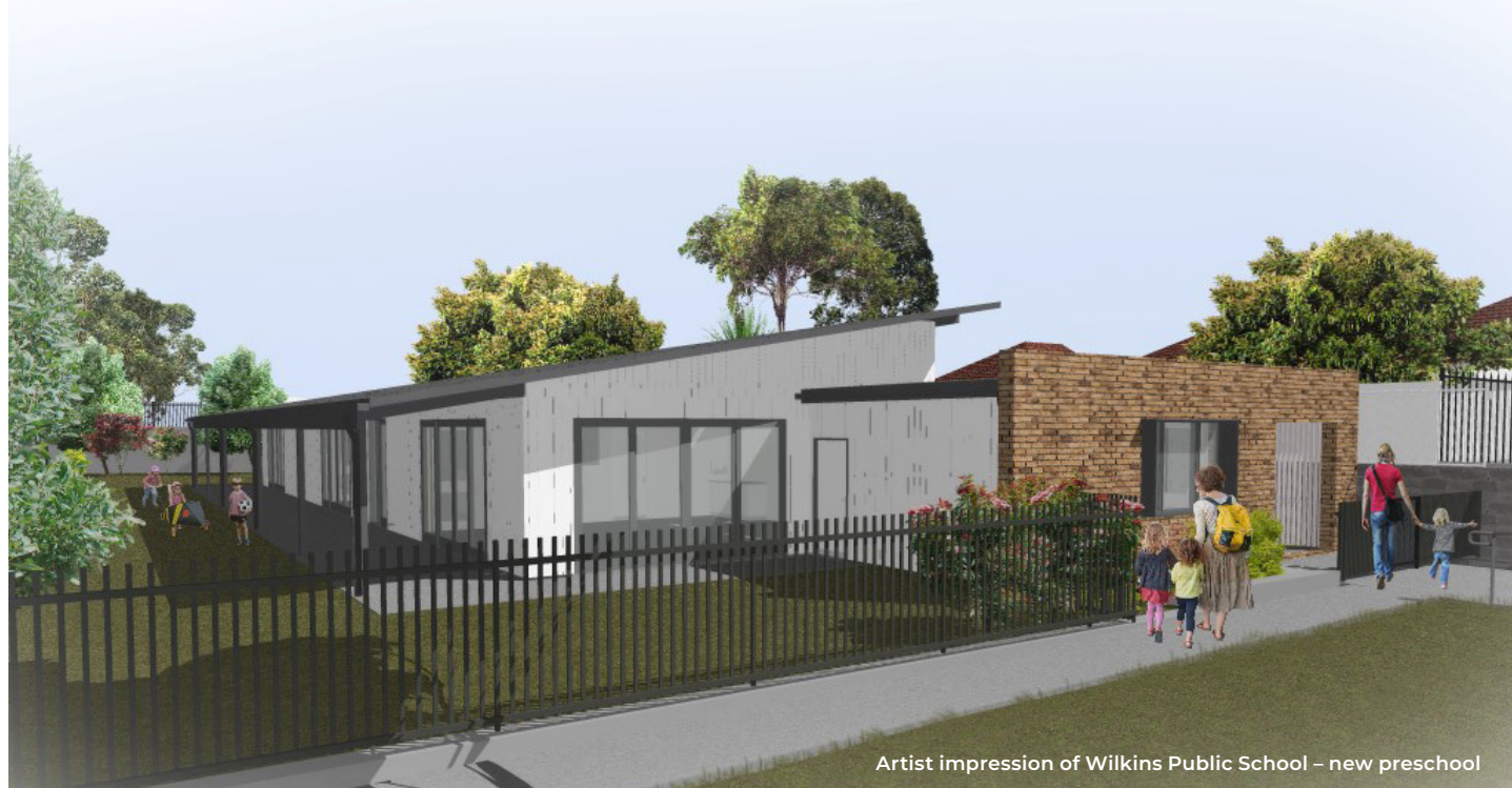
Artist impression of Wilkins Public School – new preschool

The NSW Government is investing $6.7 billion over four years to deliver more than 190 new and upgraded schools to support communities across NSW. In addition, a record $1.3 billion is being spent on school maintenance over five years. This is the largest investment in public education infrastructure in the history of NSW.