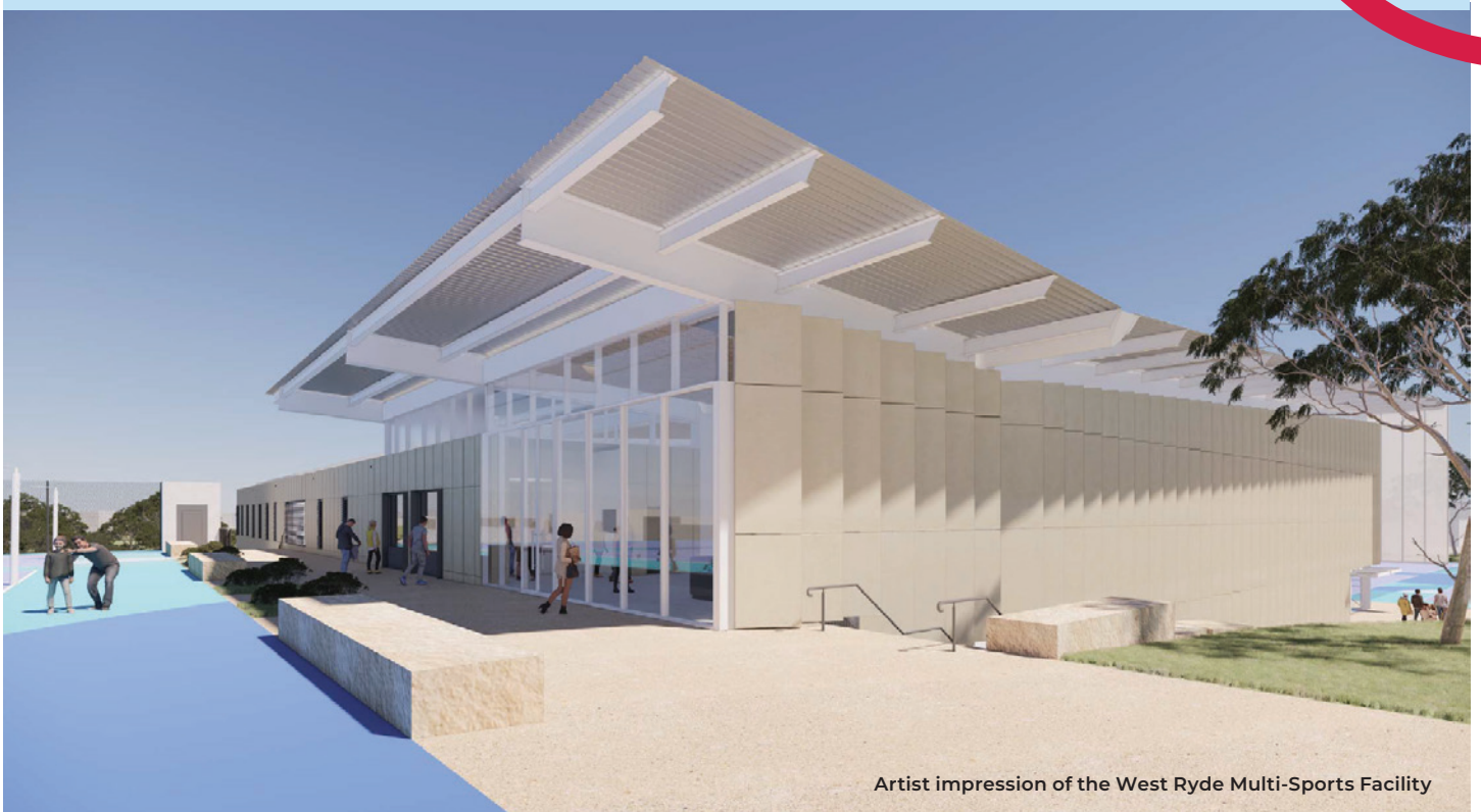
Artist impression of the West Ryde Multi-Sports Facility

The NSW Department of Education is delivering a new multi-sports facility for use by the community at the site previously occupied by Marsden High School.