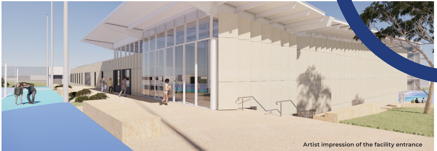
Artist impression of the facility entrance