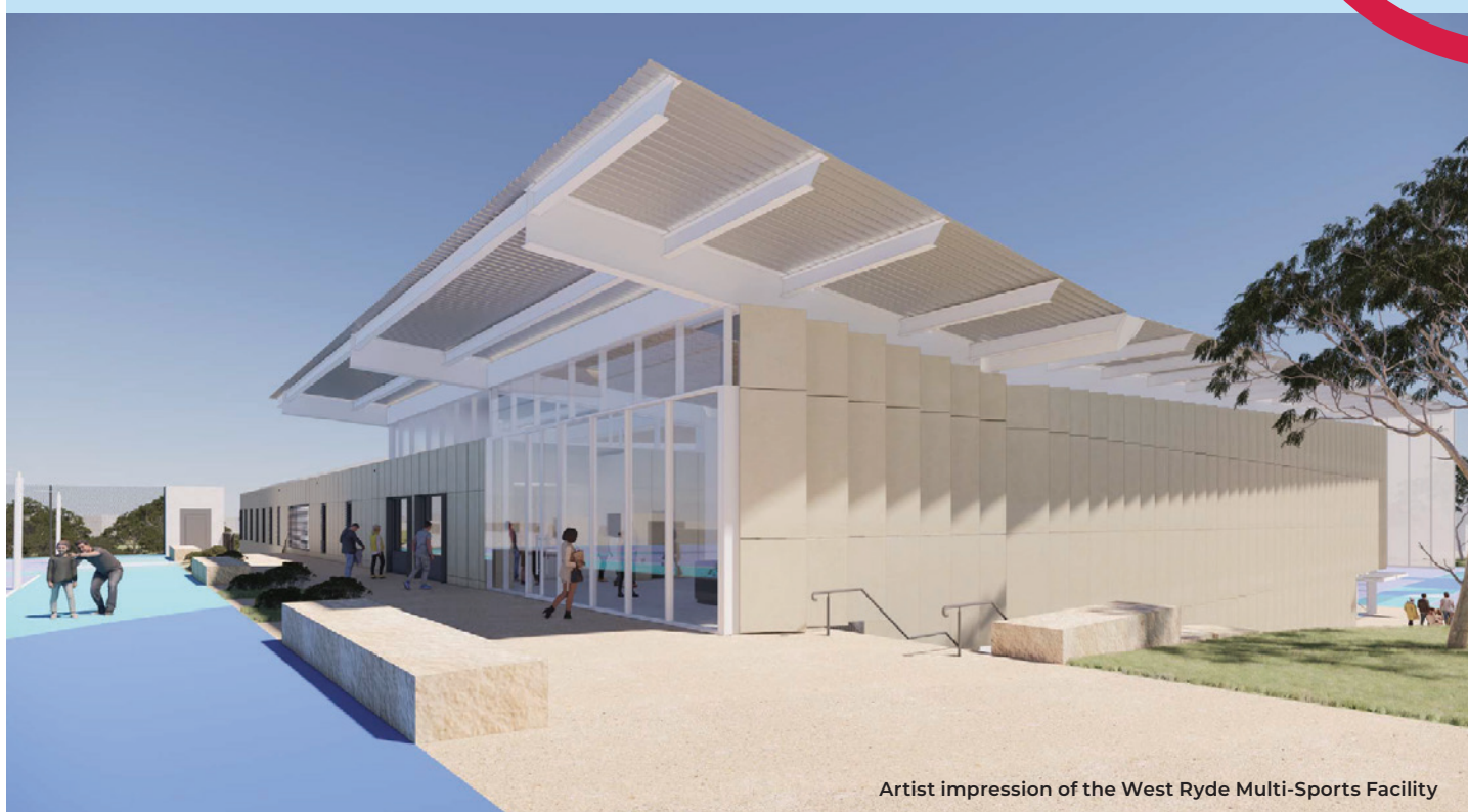
Artist impression of the West Ryde Multi-Sports Facility

The Department of Education is delivering a new multi-sports facility for use by the community at the site previously occupied by Marsden High School.