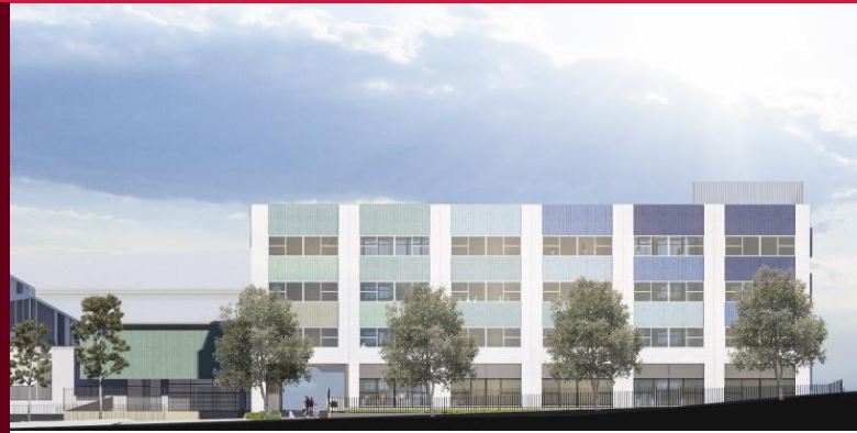
Image caption: Artist impression of the view of the new building from Burroway Road