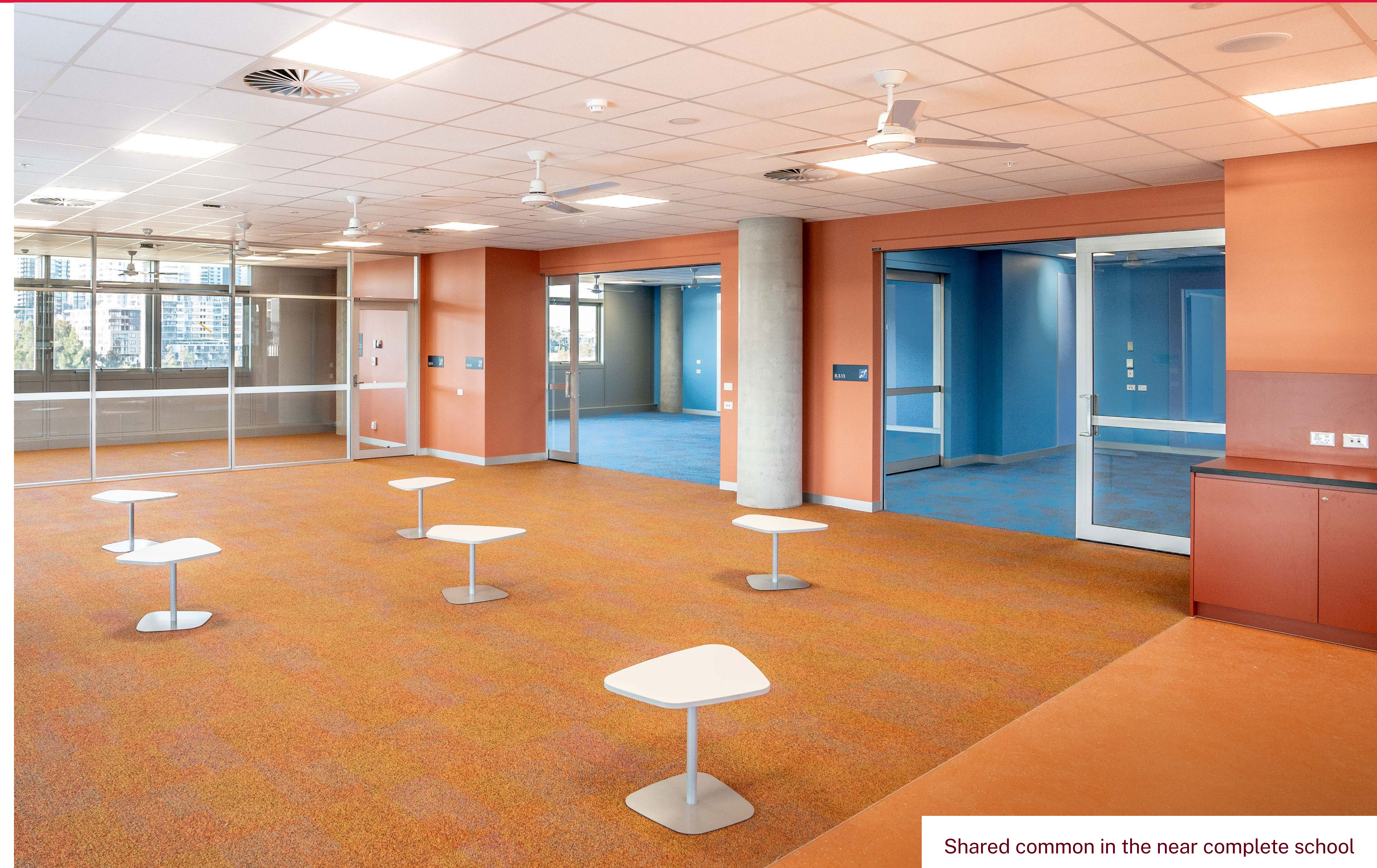
Shared common in the near complete school

The start and end of the school day is determined by the needs of the community. Wentworth Point High School will need to start and finish either prior to or after Wentworth Point Public School to allow for best traffic flow.