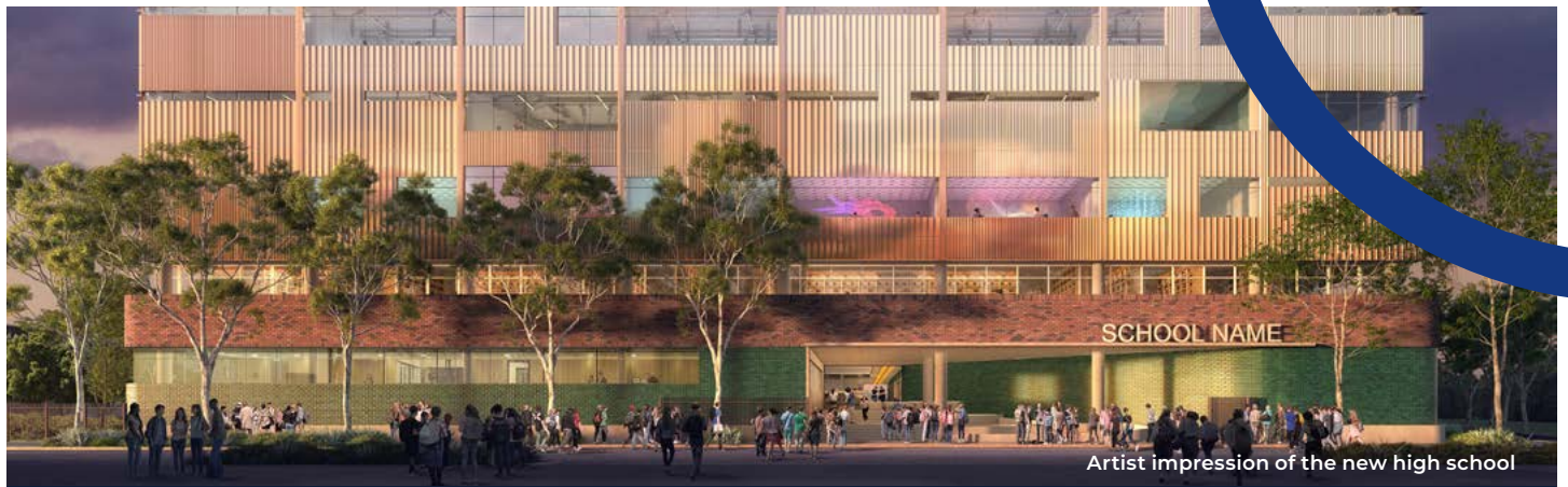
Artist impression of the new high school