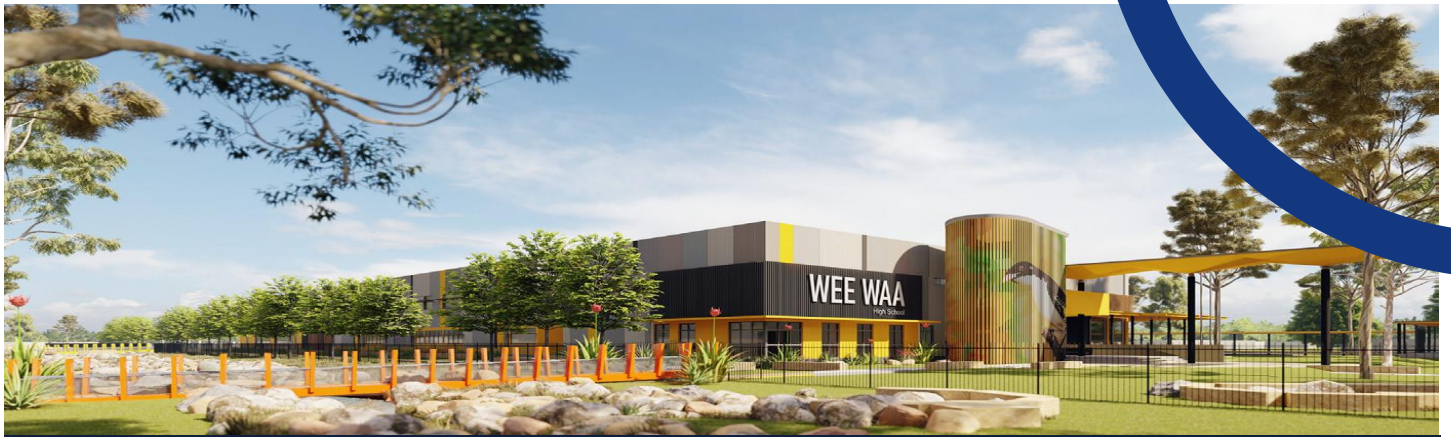
Artist impression of Wee Waa High School. Indicative only.