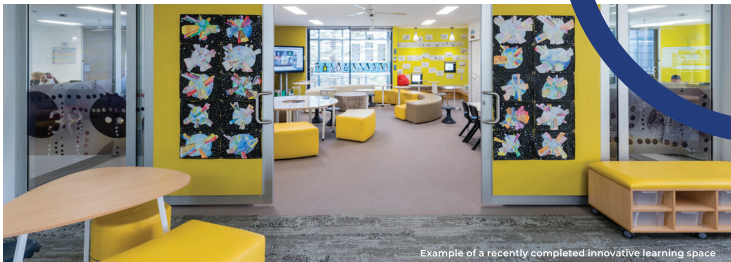
Example of a recently completed innovative learning space