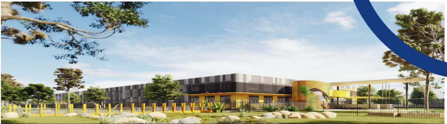
Indicative artist impression of Wee Waa High School redevelopment.