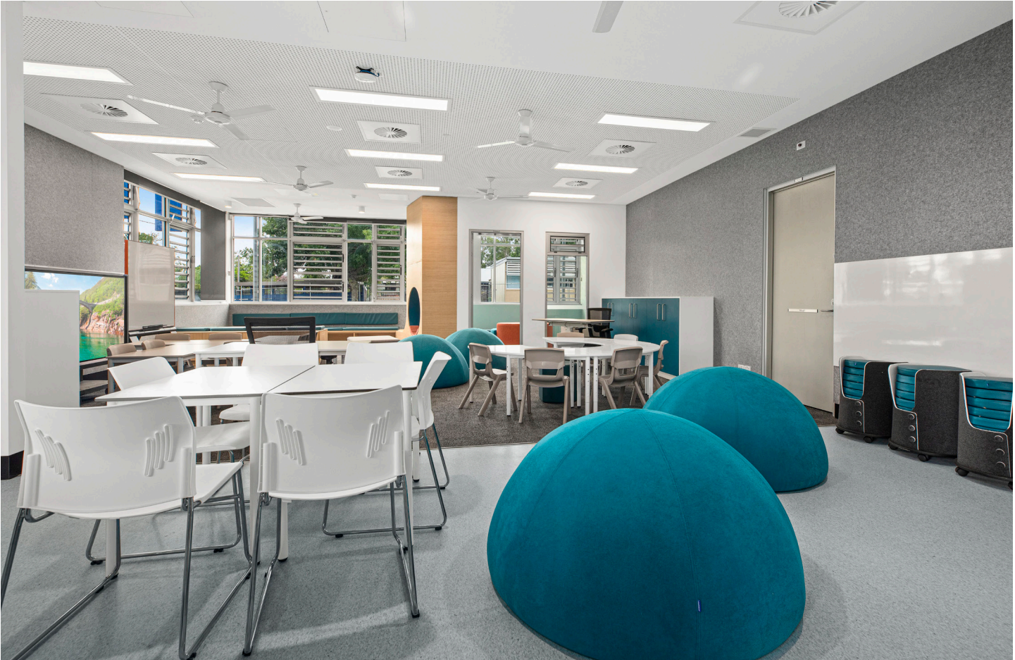
Innovative learning spaces