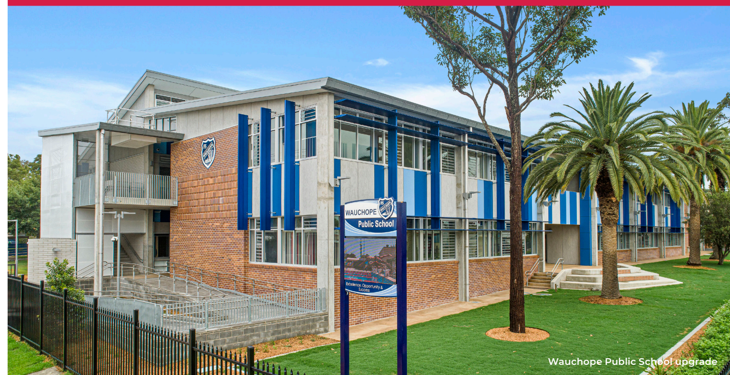
Wauchope Public School upgrade