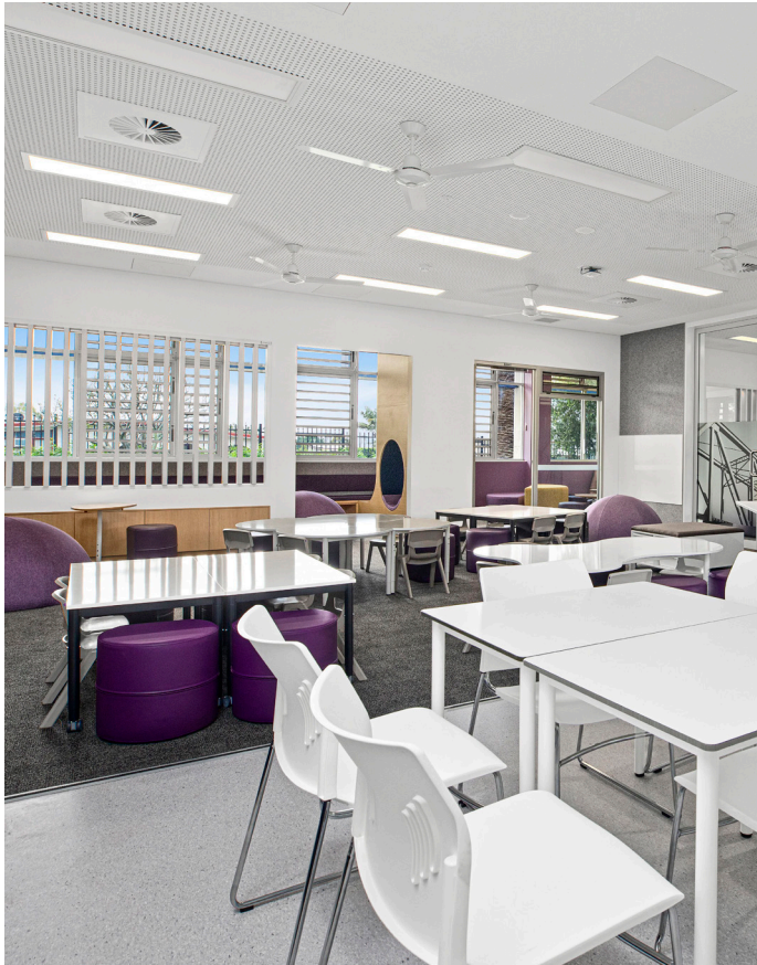
Innovative learning spaces