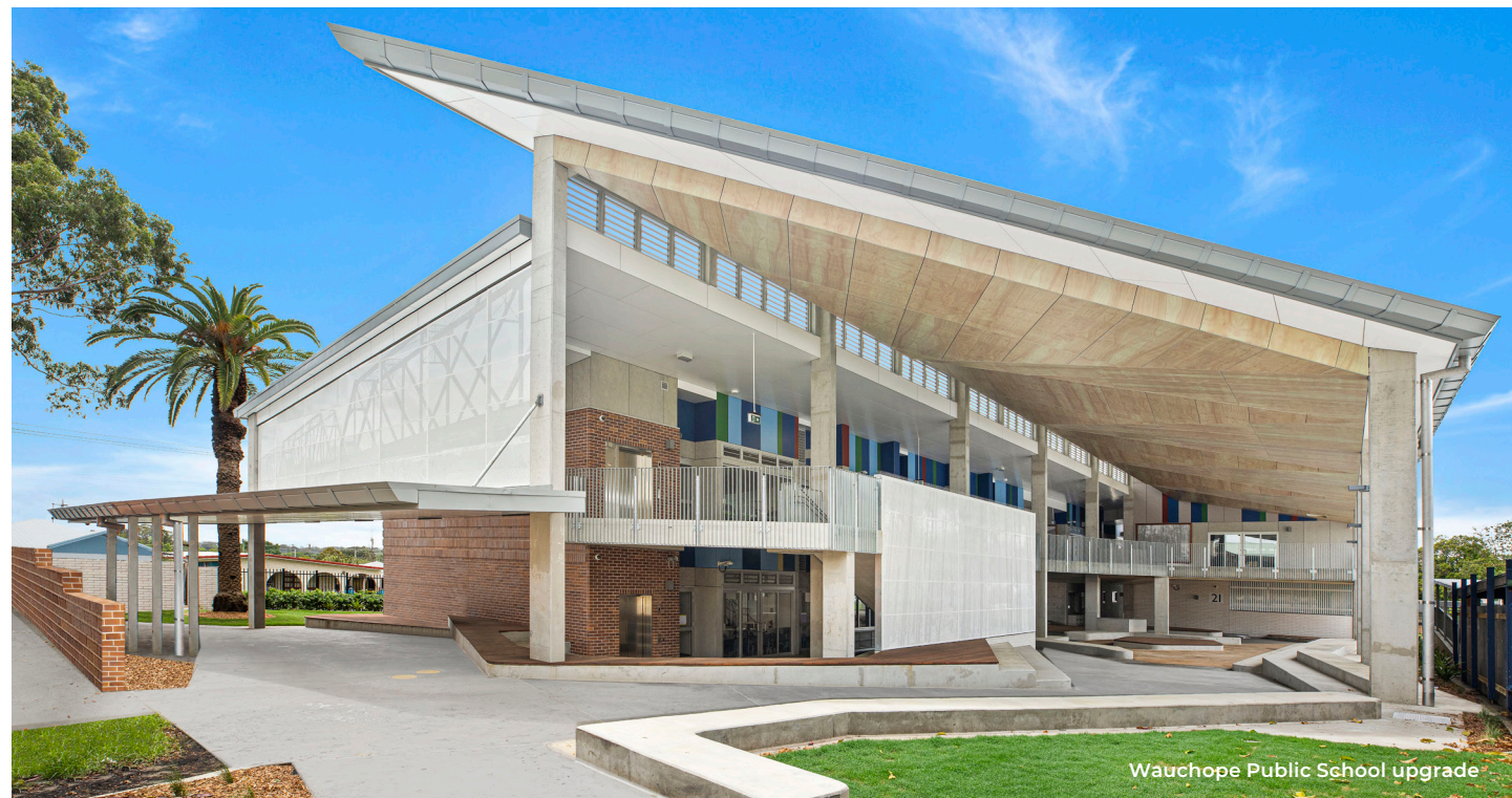
Wauchope Public School upgrade