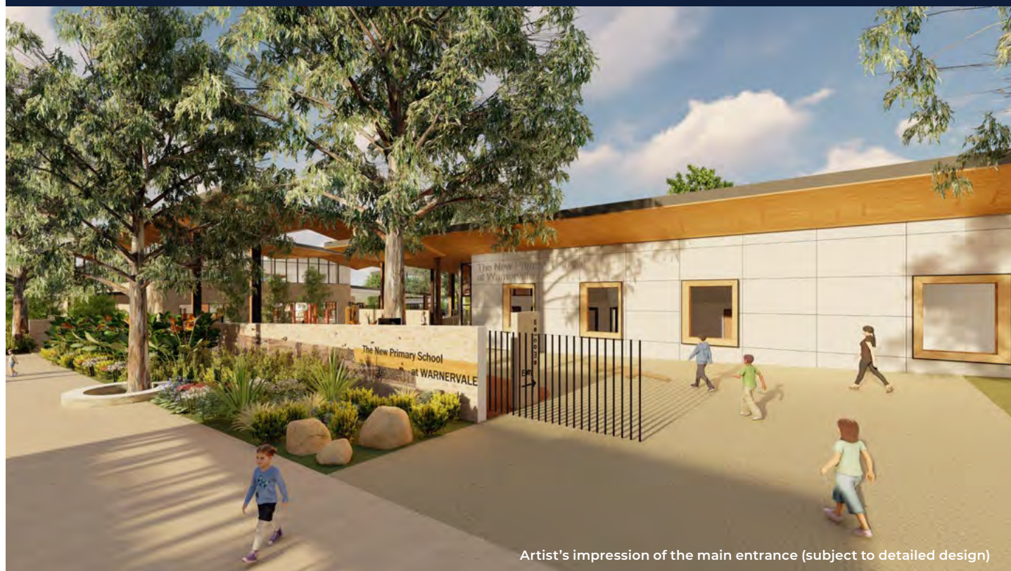
Artist's impression of the main entrance (subject to detailed design)

A project is underway to build an additional primary school in Warnervale to cater for projected enrolment growth in the area. The new school will include: