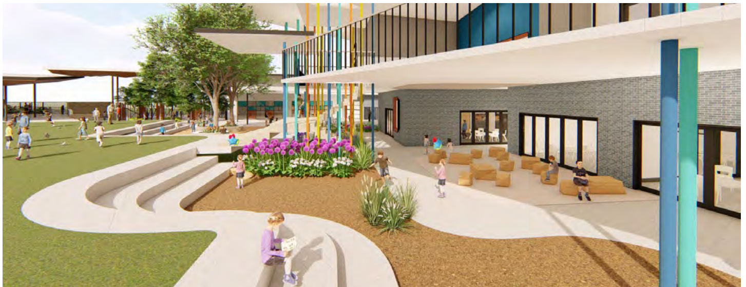
Artist's impression of the outdoor learning areas

Note: The designs are conceptual at this stage and will be further developed during detailed design.