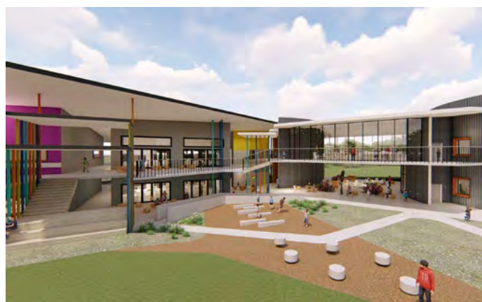
Artist's impressions of the library (subject to detailed design)

A Project Reference Group (PRG) was formed including architects, planners and design professionals, combined with the Central Coast Aboriginal Education Consultative Group president, Central Coast Council of P&Cs president, the Environmental Education Centre principal and other local school leadership representatives.