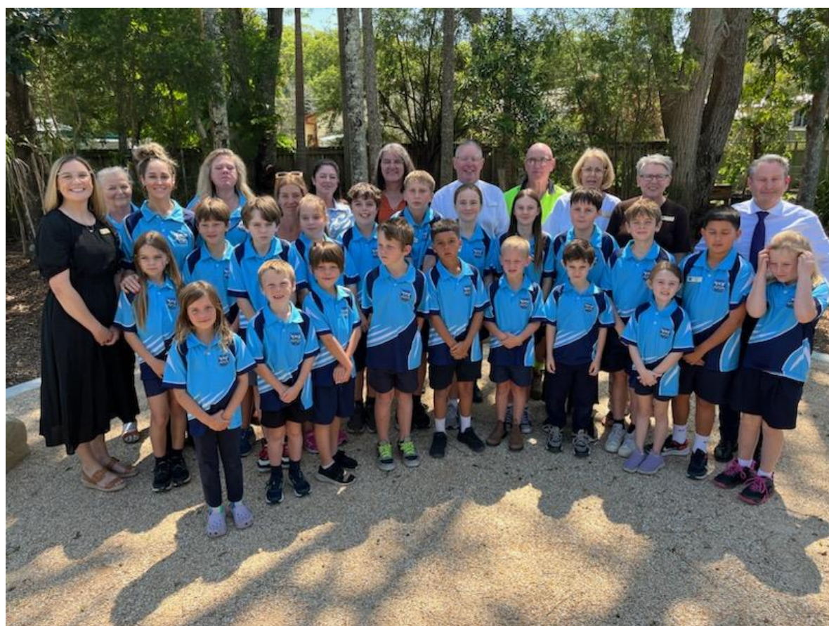
Wardell Public School students and staff at the official opening of their new flood resilient school facilities.