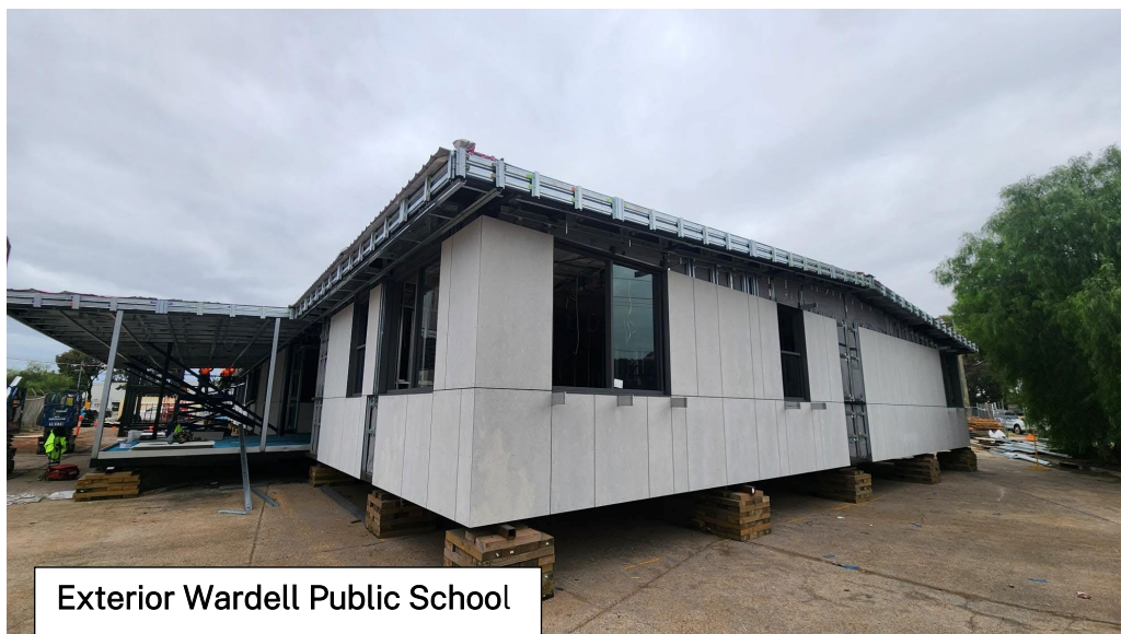
Exterior Wardell Public School

If you have questions or concerns you can also contact us via 1300 482 651 or schoolinfrastructure@det.nsw.gov.au .