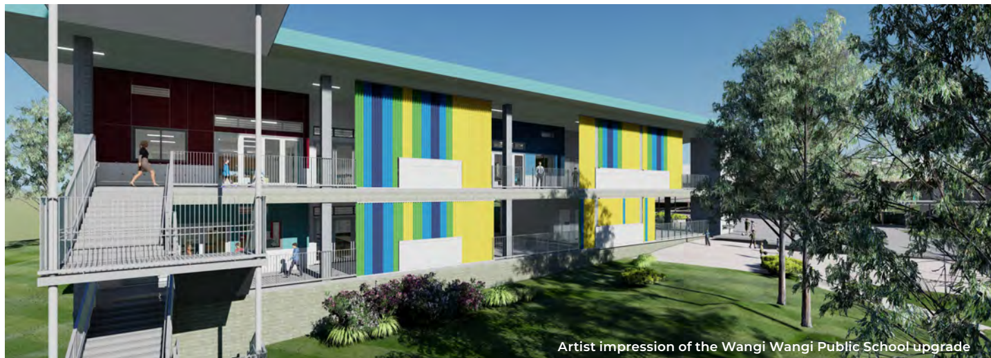
Artist impression of the Wangi Wangi Public School upgrade