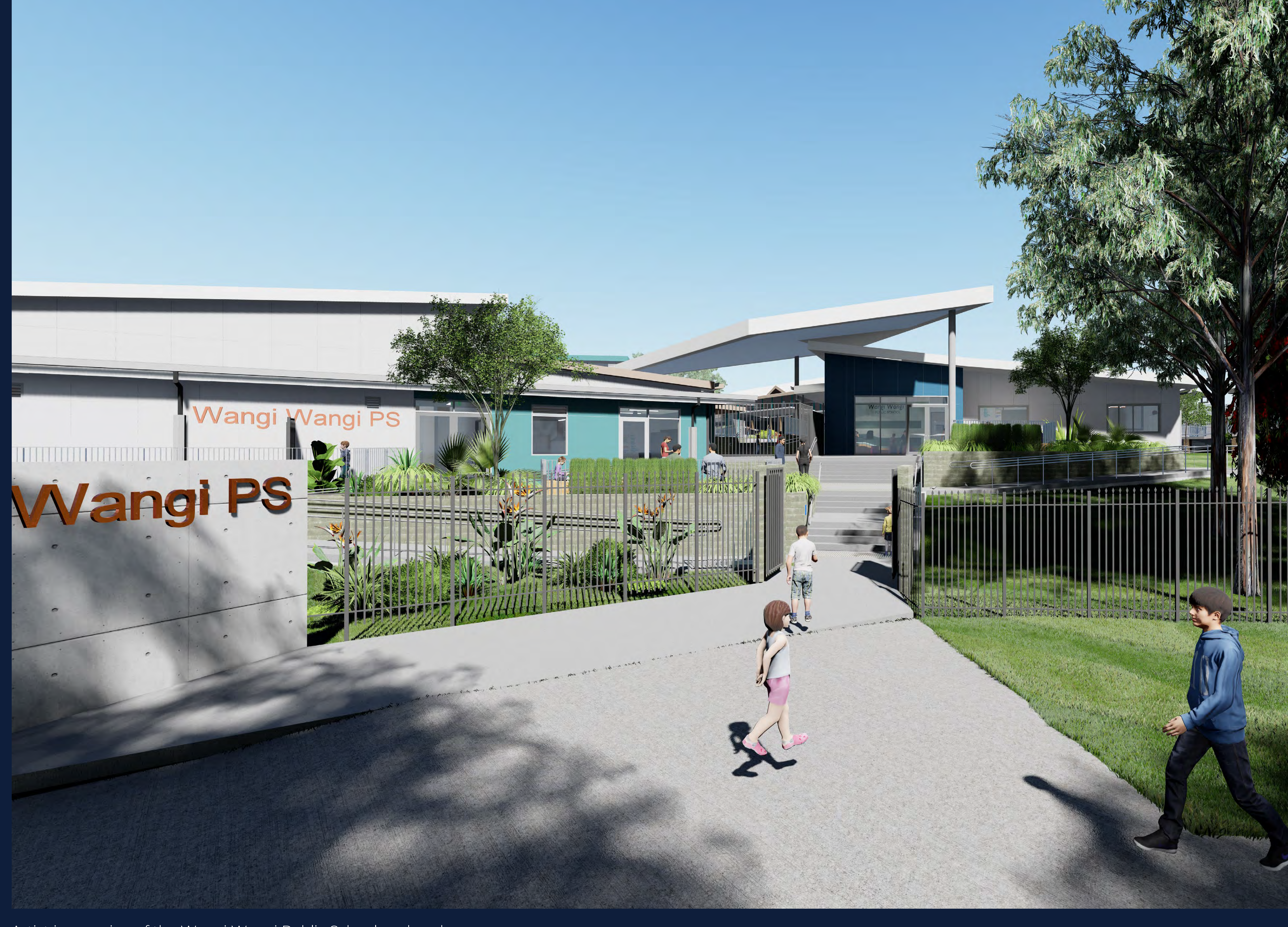
Artist impression of the Wangi Wangi Public School updgrade

A refurbishment of the existing hall into special programs spaces was completed in early 2019.